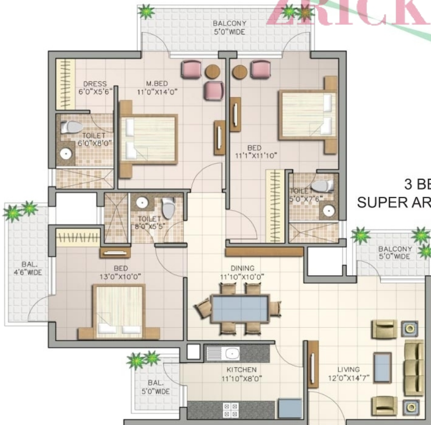
3 BED + 3 TOI SUPER AREA - 1720 SQ.FT.