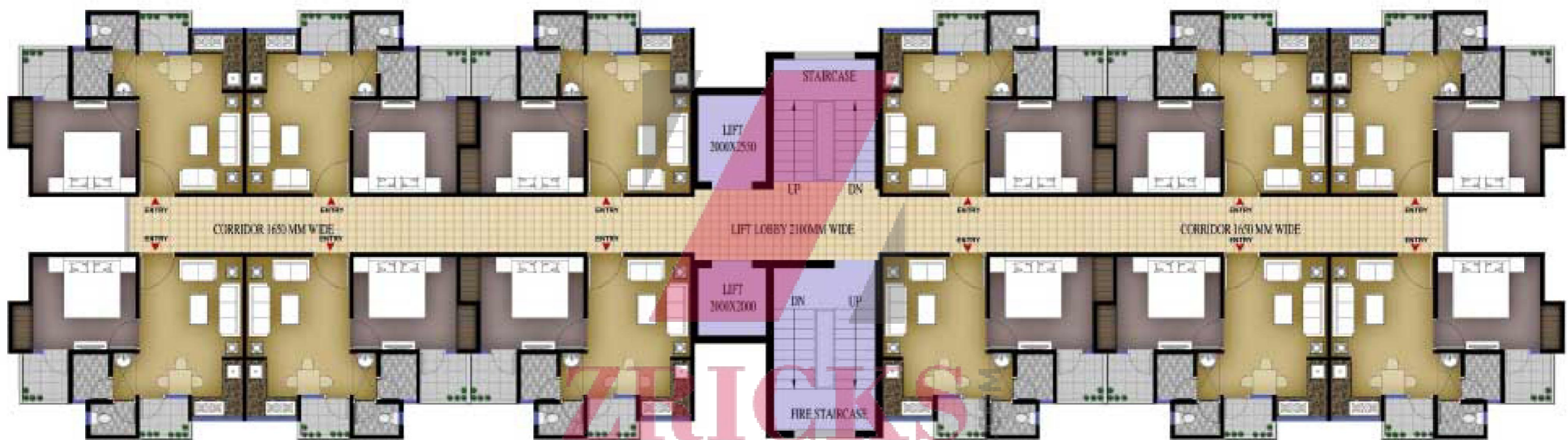
1 BHK + 1 TOILET CLUSTER PLAN