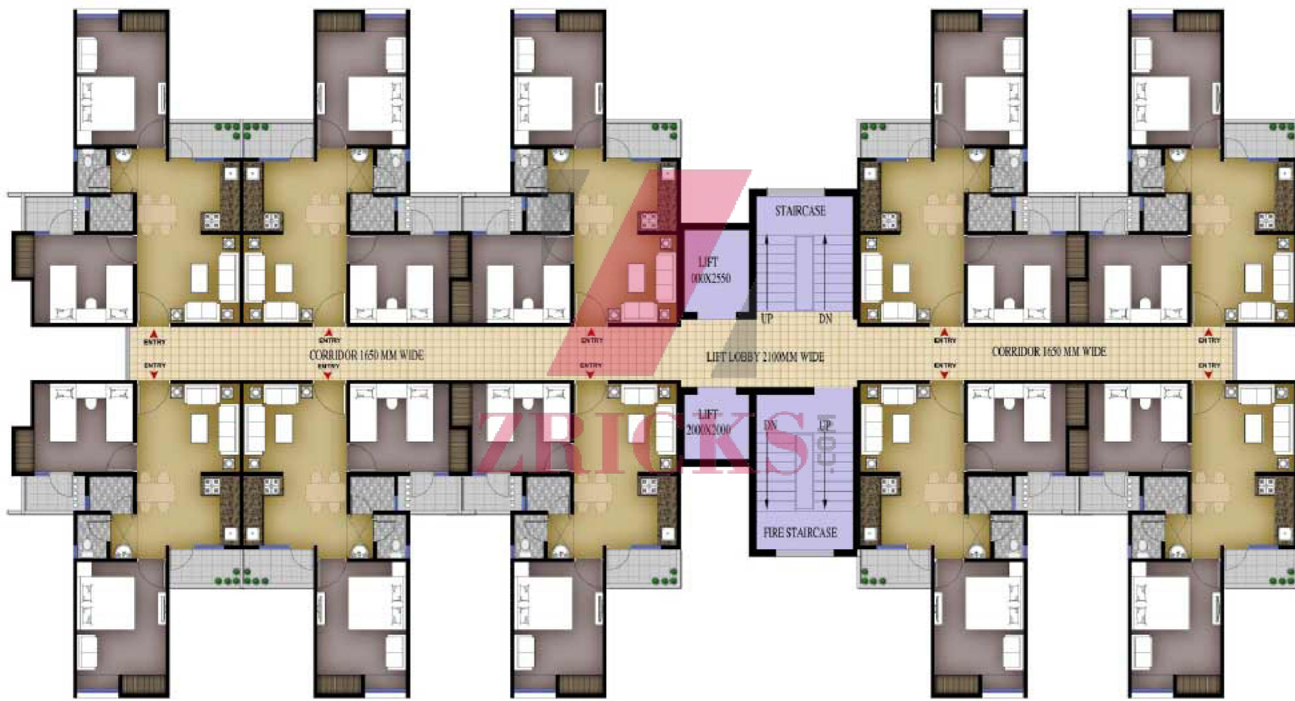
2 BHK + 1 TOILET CLUSTER PLAN