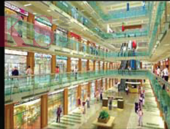
Artistic View of inside Mall