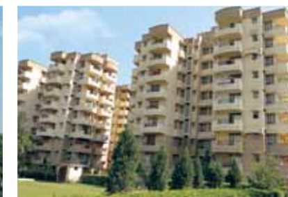
Vigyan Vihar, Plot No. GH-19, Sector-56, Gurgaon