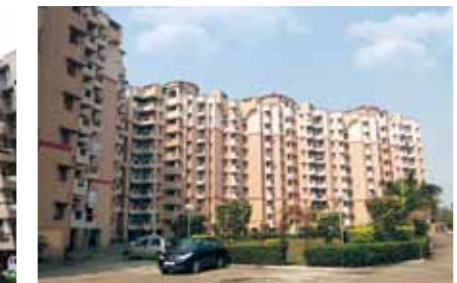
Shubhkamna Apartments, Plot No. F-31, Sector-50, Noida