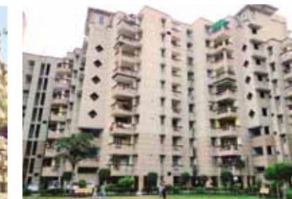
Jagdamba Apartments, Plot No. C-58/25, Sector-62, Noida