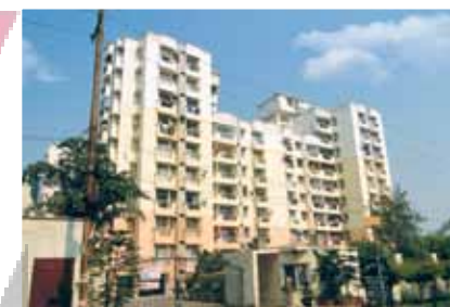
Kartik Kunj, Plot No. D-13, Sector-44, Noida