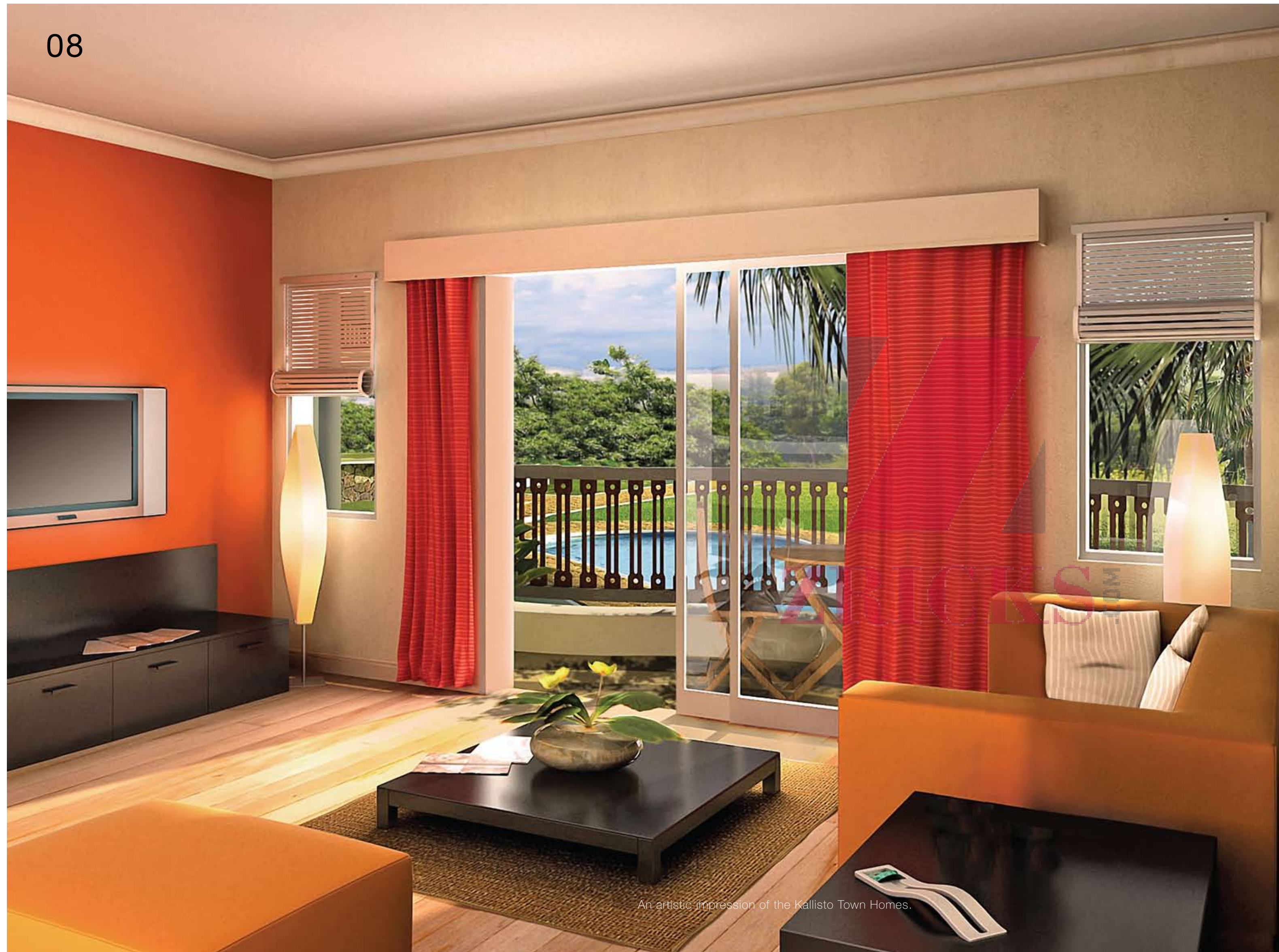
An artistic impression of the Kallisto Town Homes.