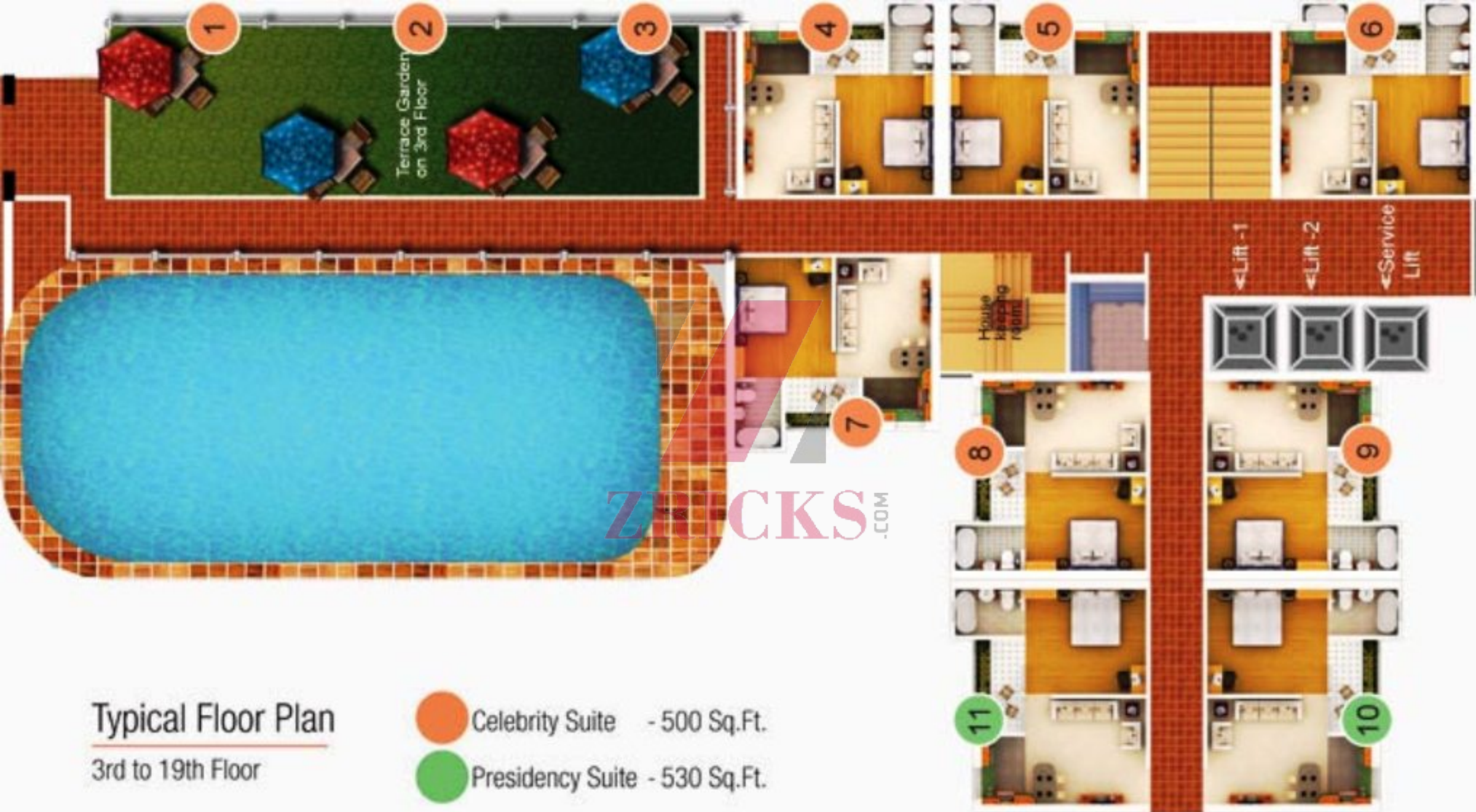
Typical Floor Plan 3rd to 19th Floor