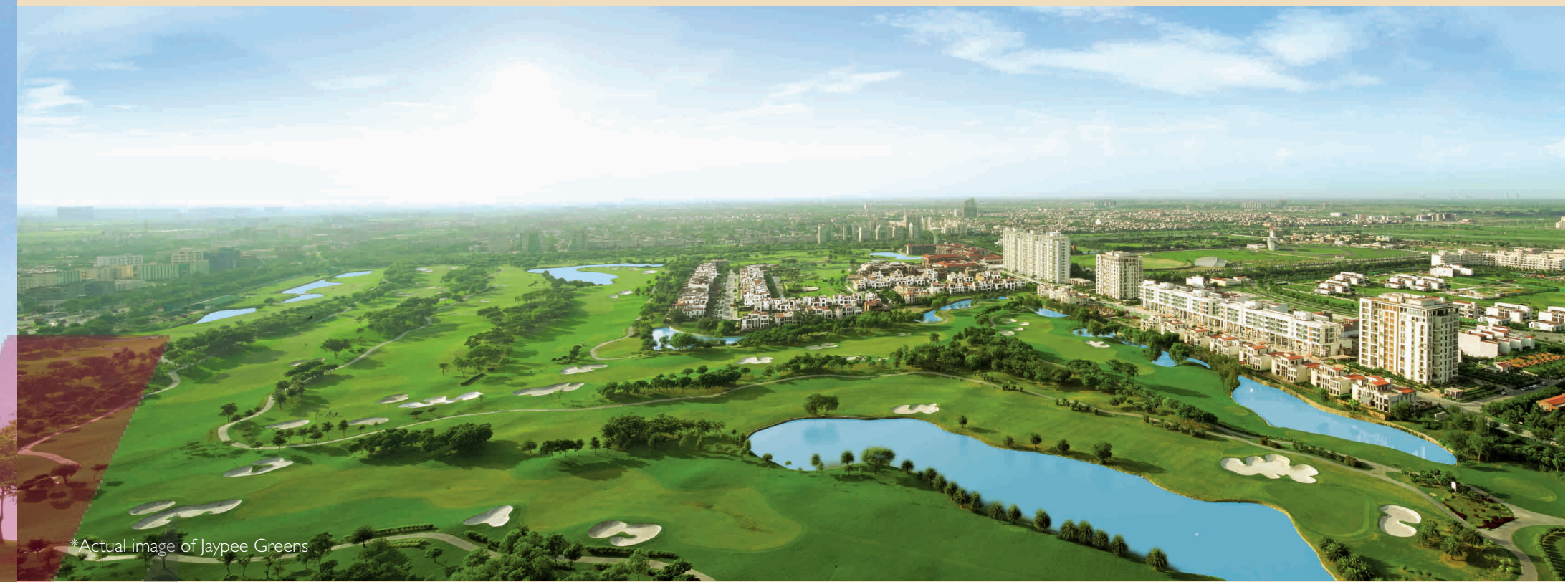
*Actual image of Jaypee Greens