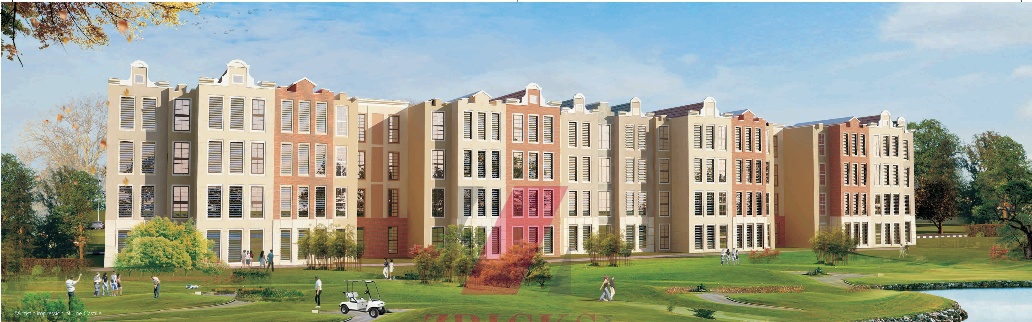
*Artistic Impression of The Castille