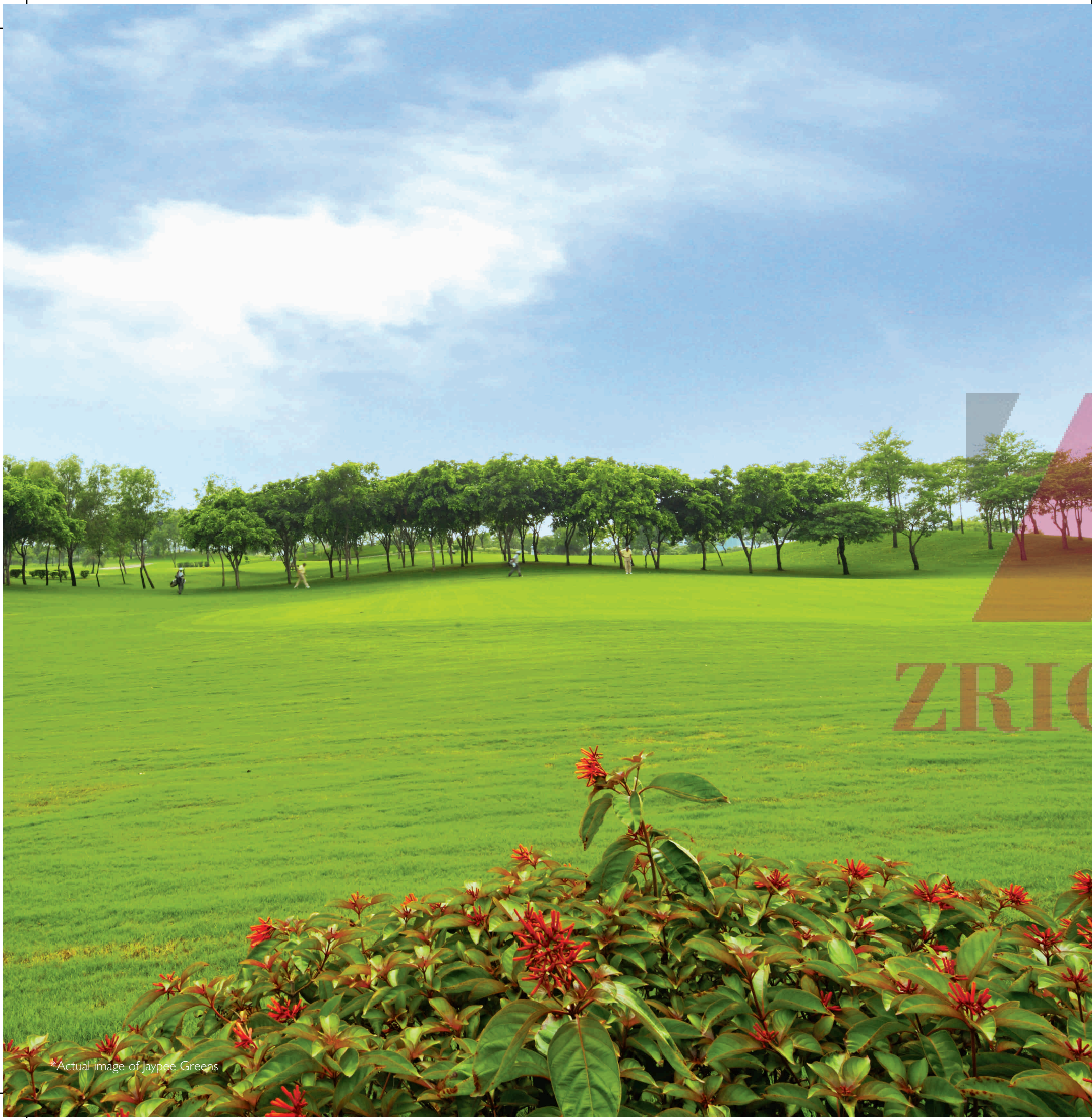
*Actual image of Jaypee Greens