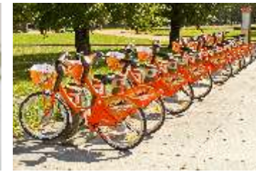
Cycle On Hire