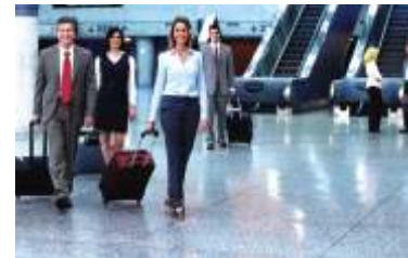
Delhi International Airport just 55 kms away