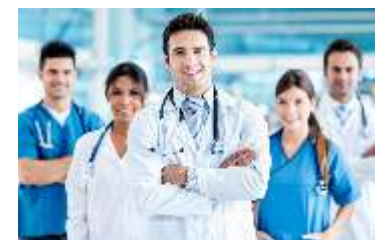
Doctor on Call