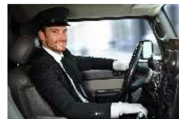
Driver on Call