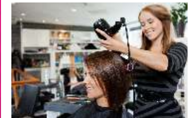
Beautician on Call