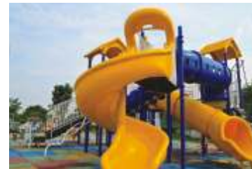
Kids Play Area