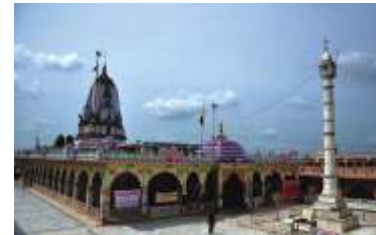
World famous Jain Temple at Tijara, 10 mins drive