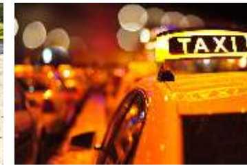
Taxi On Call