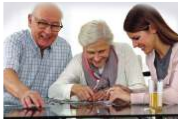
Senior Citizen Care