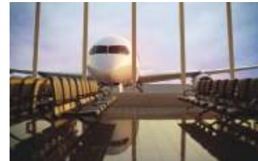
Proposed Bhiwadi Airport just 10 mins away