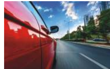
On the newly built Alwar Expressway with a front of 225 mtrs