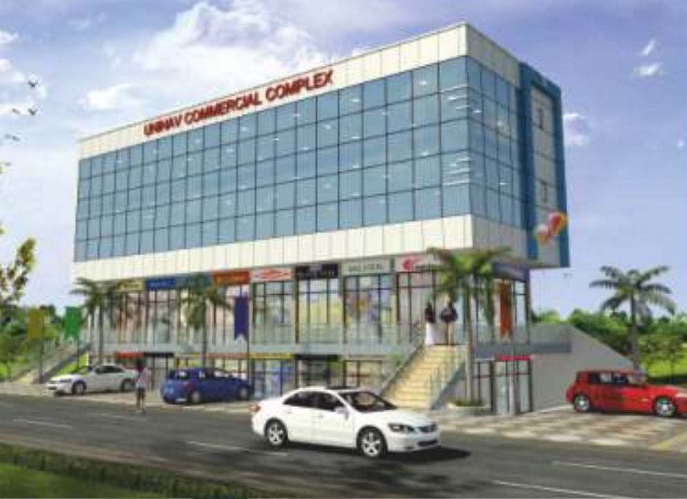
◀ Uninav Commercial Complex, Vaishali