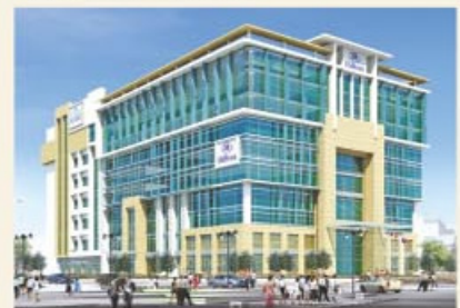
Angel Business Square - Sahibabad