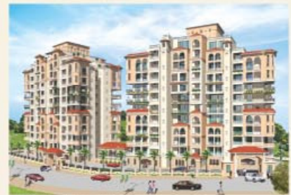
Angel Platinum - Indirapuram