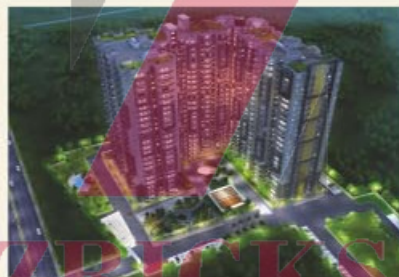
Angel Jupiter - Indirapuram