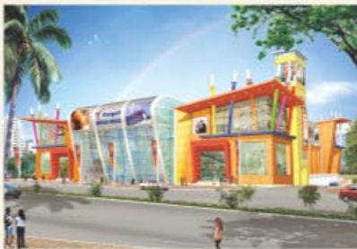
Angel Mega Mall - Kaushambi