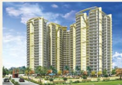
Angel Mercury - Indirapuram