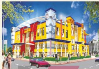
Angel Prime Mall - Panipat