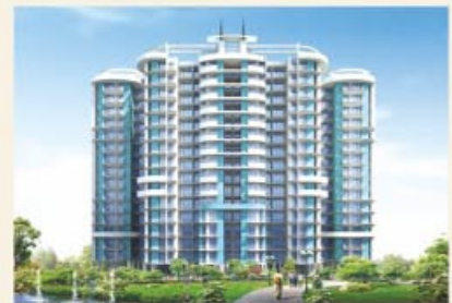
Angel Golf Avenue-II, Sec.75, Noida