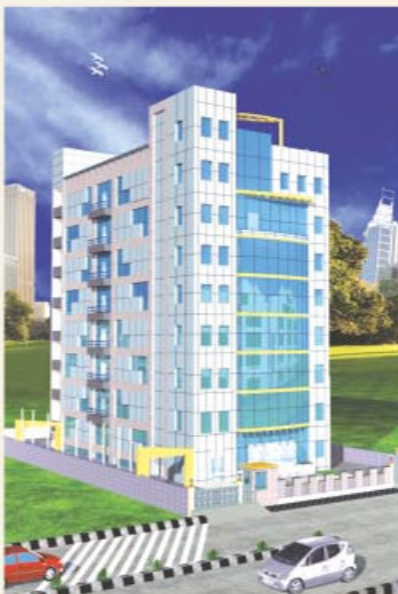
Angel Tech Park - Sec.62, Noida