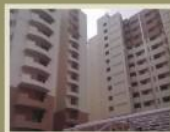
Actual Site Picture JM Royal Park - Vaishali