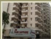
Actual Site Picture JM Park Sapphire - Vaishali