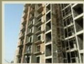
Actual Site Picture JM Orchid - Noida - Ongoing