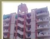
Actual Site Picture JM Royal Legacy - Vasundhara

Disclaimer: All above features, sizes and layouts are tentative and subject to change without prior notice. They are purely conceptual and constitute no legal offerings. Balconies are subject to change as per elevation drawings. The Parking shown in the layout is tentative and can be changed at sole discretion of the company. 1 sq.mtr. = 10.764 sq.ft, 1 Acre = 4047 sq.mtr. (Approx.)