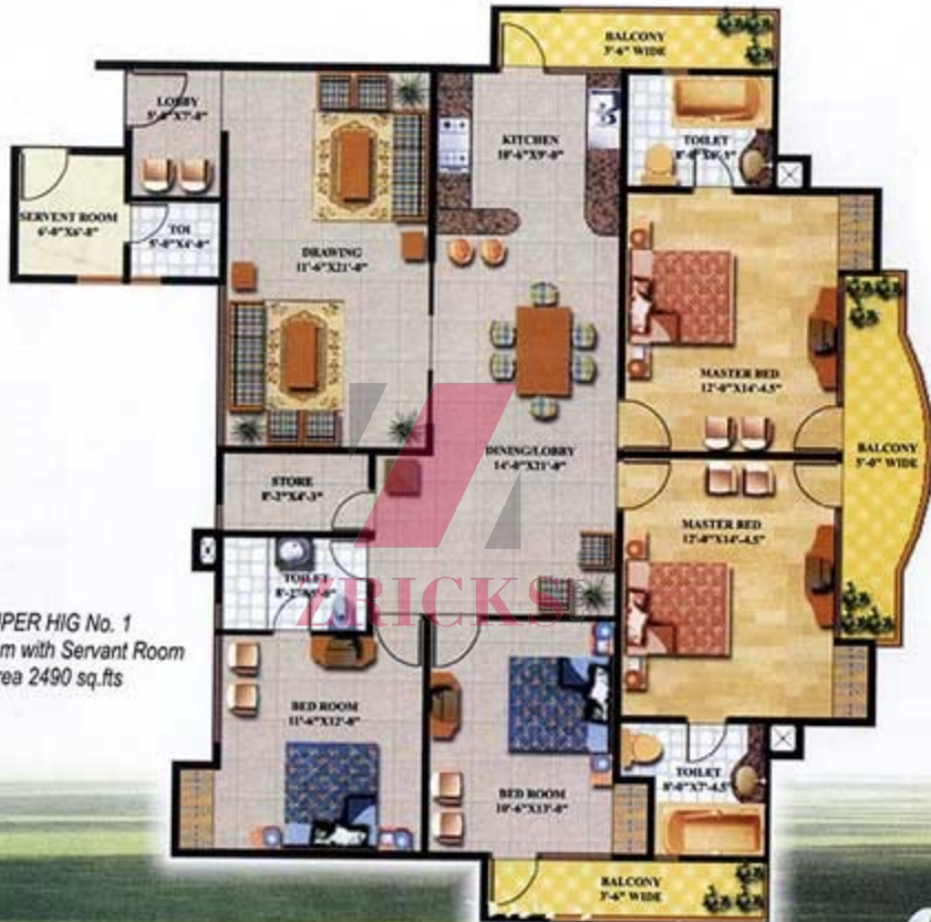
SUPER HIG No. 1 4 Bedroom with Servant Room Area 2490 sq.fts