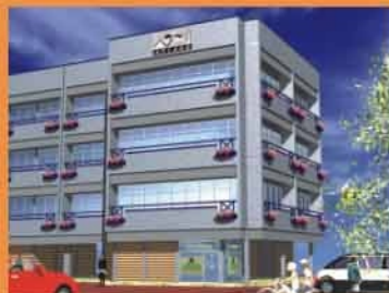
National Arcade, Gazipur