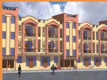
'e' - Residency, Kaushambi