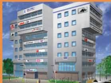
Rishabh Corporate Tower, Karkardooma