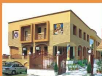
School Building, Anand Vihar