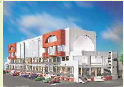
Express Market, Indirapuram