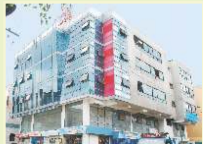
Express New City, Bangalore