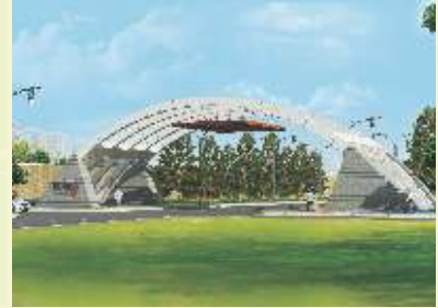
Express City, Sonepat