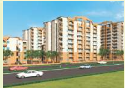
Express Garden, Indirapuram