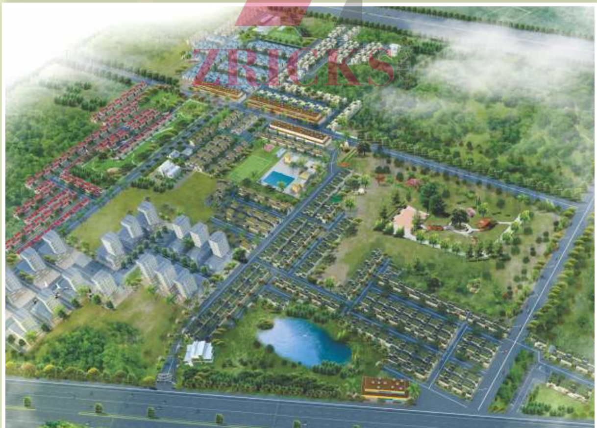
AERIAL VIEW - EXPRESS CITY