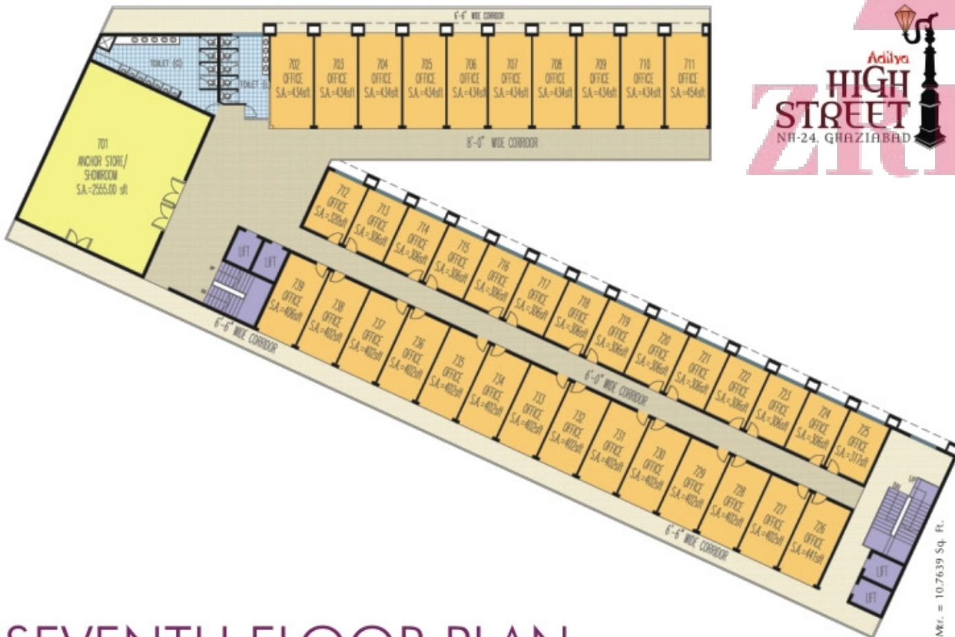
SEVENTH FLOOR PLAN