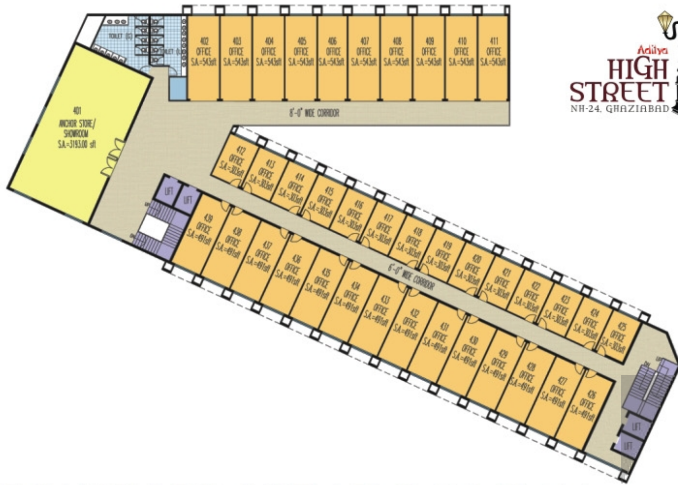
FOURTH TO SIXTH FLOOR PLAN