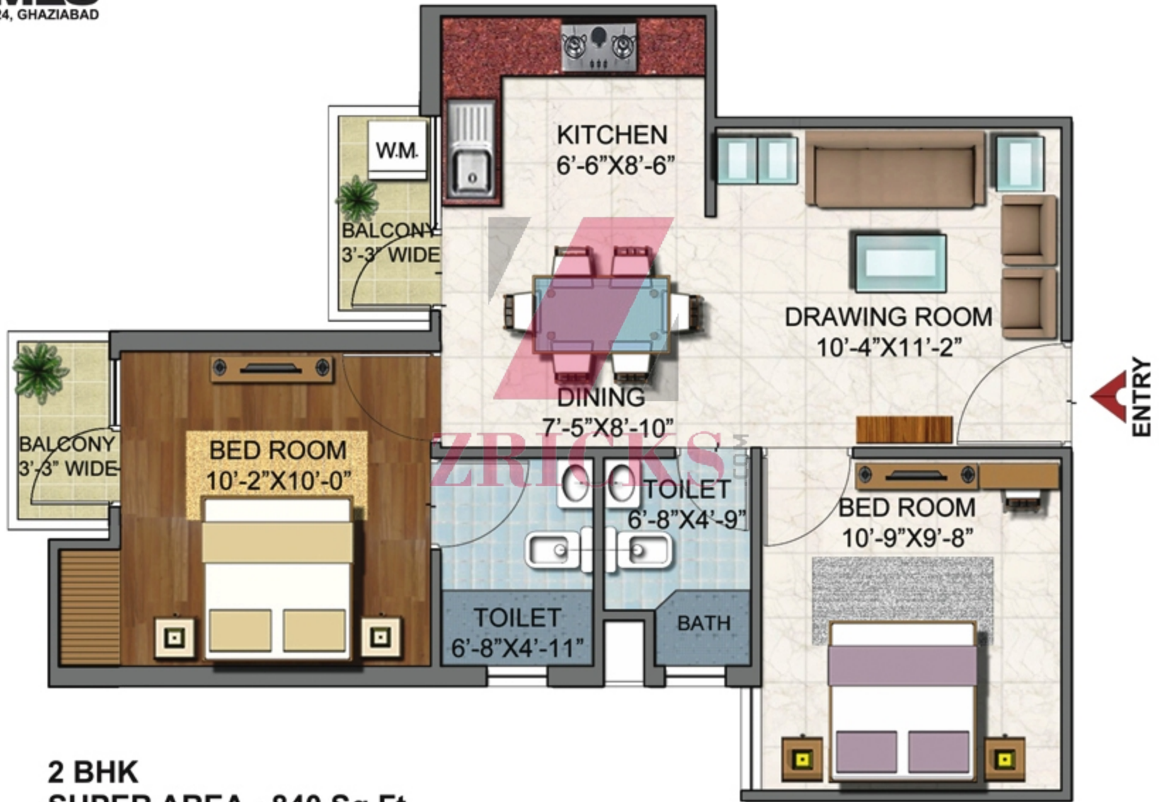
2 BHK SUPER AREA - 840 Sq.Ft.