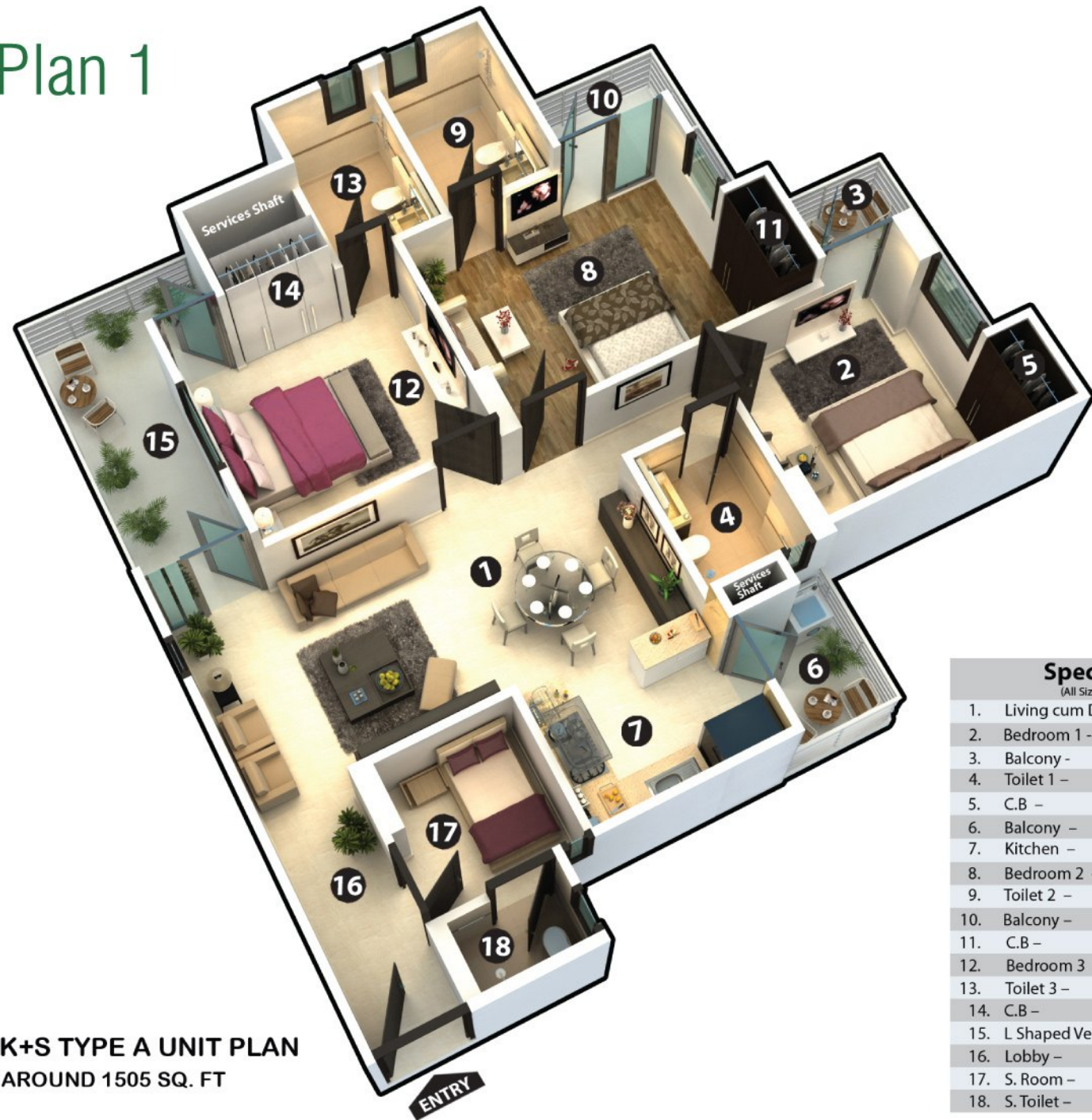
WINDPARK 3 BHK+S TYPE A UNIT PLAN SUPER AREA: AROUND 1505 SQ. FT