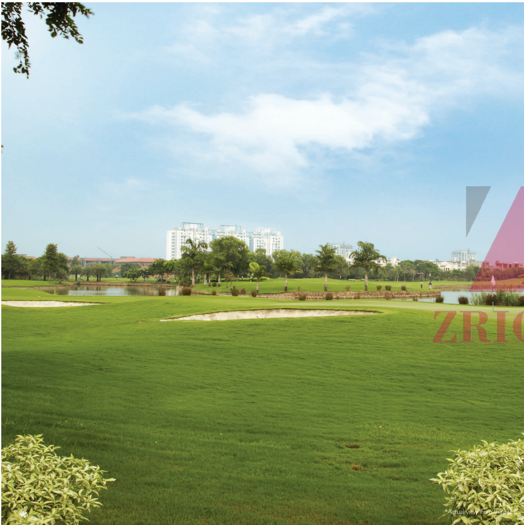
*Actual view from the site