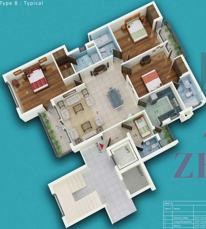
Type B : Typical