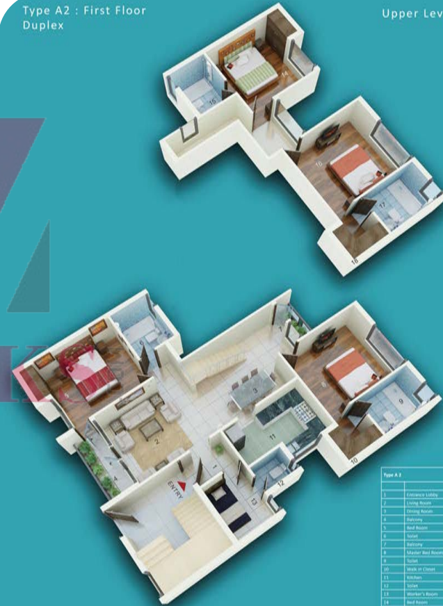
Upper Level Plan