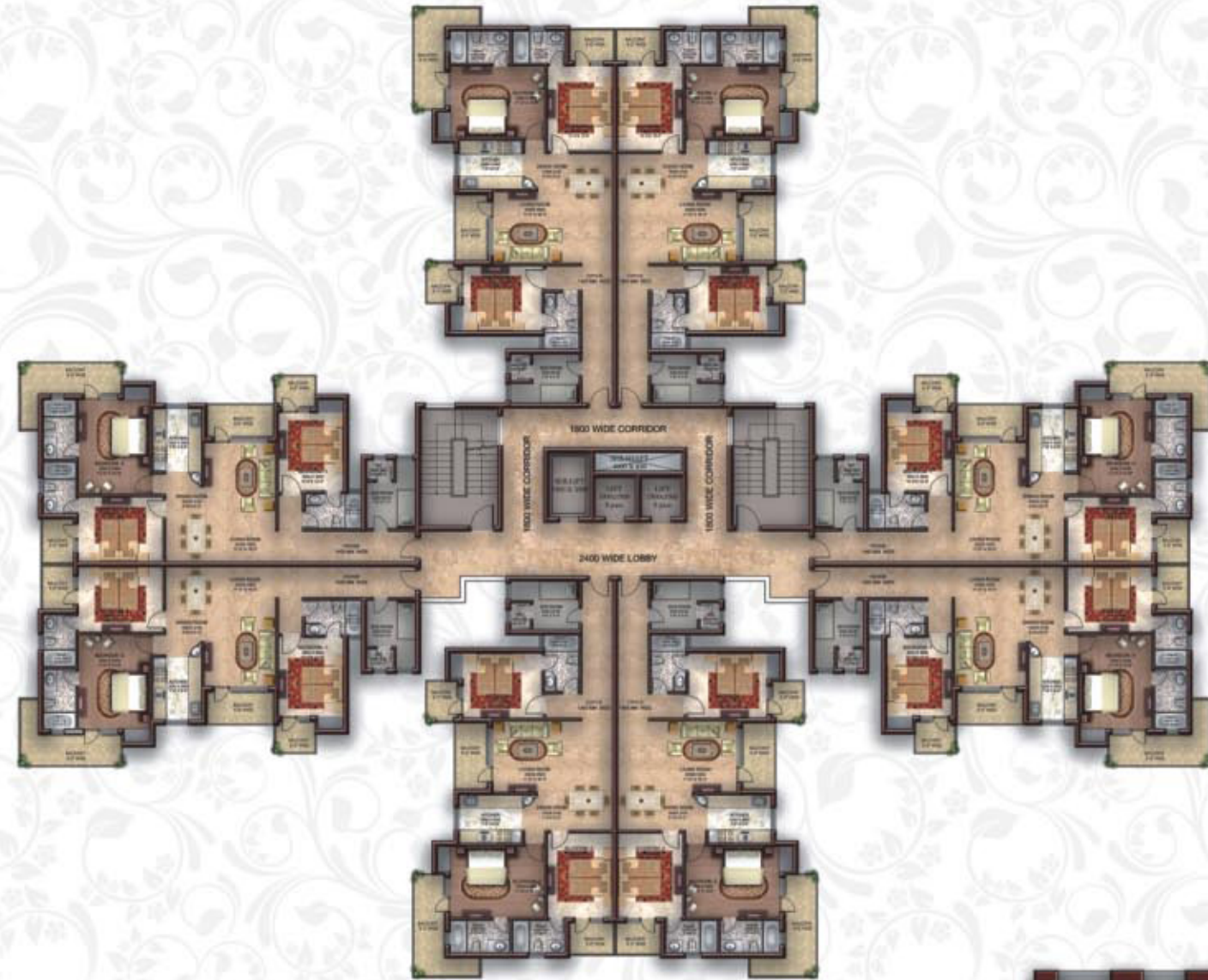
CLUSTER PLAN : TOWER -4 1st to 19th Floors