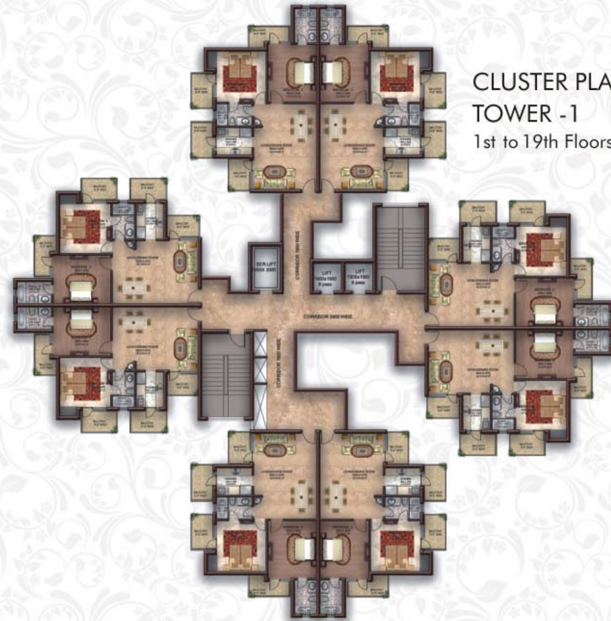
CLUSTER PLAN : TOWER -1 1st to 19th Floors