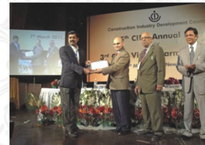
VISHWAKARMA AWARD 2011

The group directors have considerable experience in development and marketing of various real estate projects. People, technology and clear thinking have shaped Aastha Infracity into a customer friendly organisation, fully geared to meet the techno-economic requirements of futuristic real estate projects.