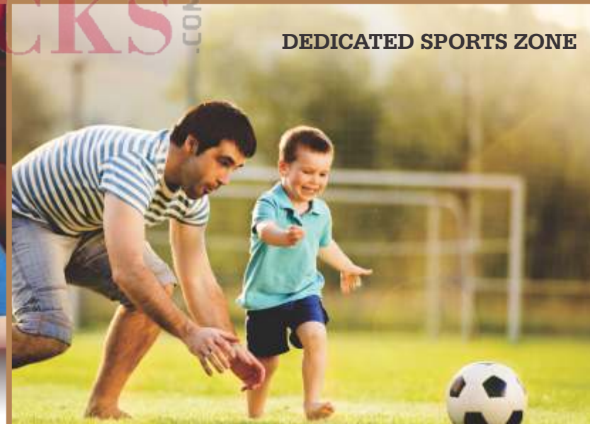
DEDICATED SPORTS ZONE