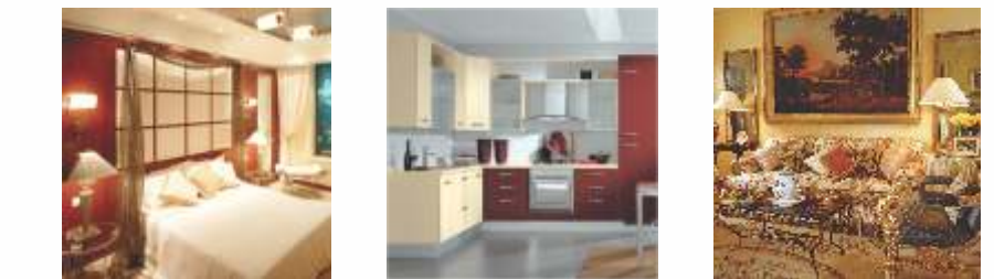
Dwarkadhis Projects Pvt. Ltd.

An eminent name in Real Estate for its indisputable focus on thoughtful planning of layouts, quality of construction & proficient management. The Company was incorporated by Magppie Group for diversified business in Real Estate. Magppie Group, established in 1974, has evolved as a premium brand and has set a benchmark for style as well as quality in contemporary Stainless Steel Kitchenware, Lifestyle Accessories and Modular Kitchens with a success history and pioneering presence in over 42 countries including USA, Japan, Germany, Australia, Denmark, Italy, Greece amongst others. Magppie Group has won several national and international laurels for design and quality, notable among them being "The Red Dot award" & the "IF award" . The group is epitomizing the values which have made the brand famous across the Globe.