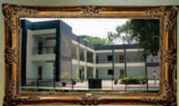
Project - Lecture Building Location - Tugakabad Client - Railway Status - Completed