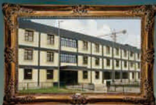
Project - Railway Gards & Drivers Rest House Location - Opp. Tugakabad Metro Station Client - Railway Status - Completed