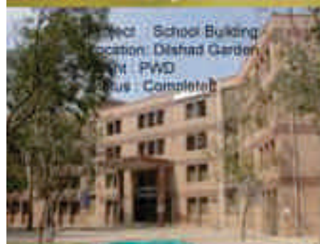
Project - School Building Location - Dishaad Garden Client - PWD Status - Completed