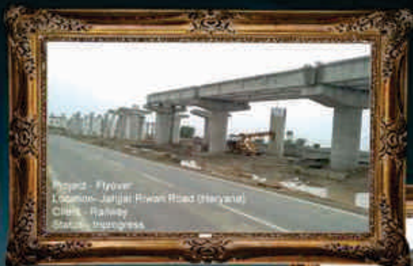
Project - Flyover Location - Jajjal Pawan Road (Haryana) Client - Railway Status - In progress