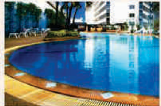
Open Air Swimming Pool