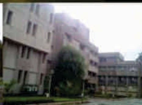
Project - School Building Location - Loni Road, Shadra, Delhi Client - EWC Status - Completed