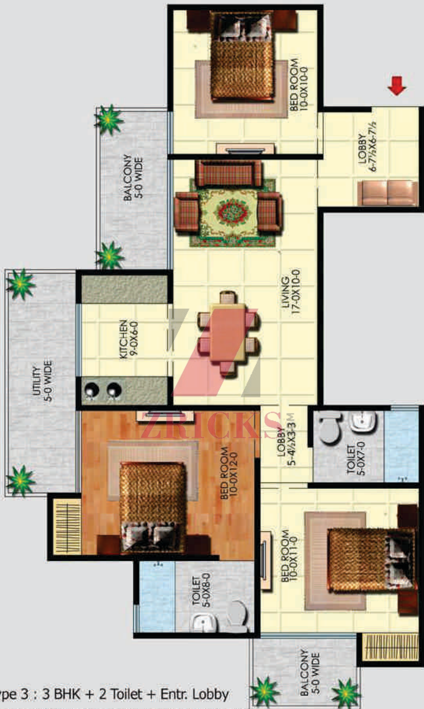
Type 3 : 3 BHK + 2 Toilet + Entr. Lobby HOMES WITH PERSONAL ENTERENCE WAY Total Super Area : 1280 sq. ft.