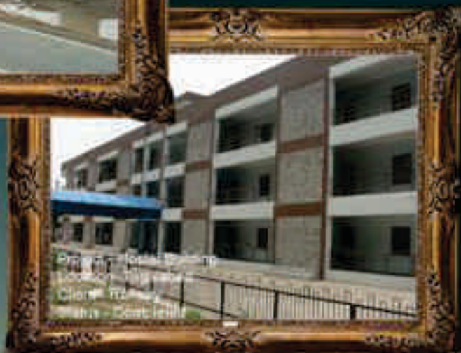
Project - Roadover Bridge Location - V/E. Pallawas, NH - 71, Haryana Client - Railway Status - In progress