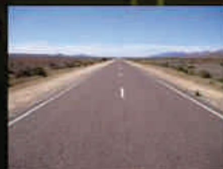
Project - Boader Roads Location - Indo Pak Boder, Gujrat Client - CPWD Boader Fencing division Status - Completed