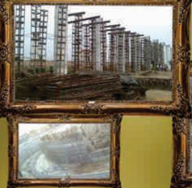
Project - Rail underpass (Pushing technology) Location - Sarjanj Gandhi Transport Nagar, Delhi Client - Railway Status - In progress