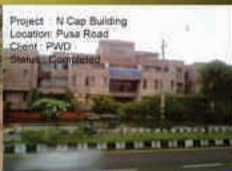
Project - N-Cap Building Location - Pusa Road Client - PWD Status - Completed