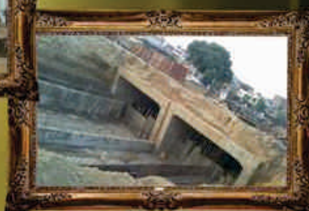
Project - Rail underpass (Pushing technology) Location - Samaypur Badli Railway crossing No-9 Client - Railway Status - In progress