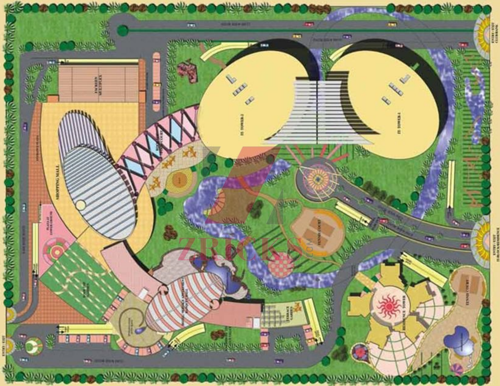
AMRAPALI TECH-PARK AT GREATER NOIDA