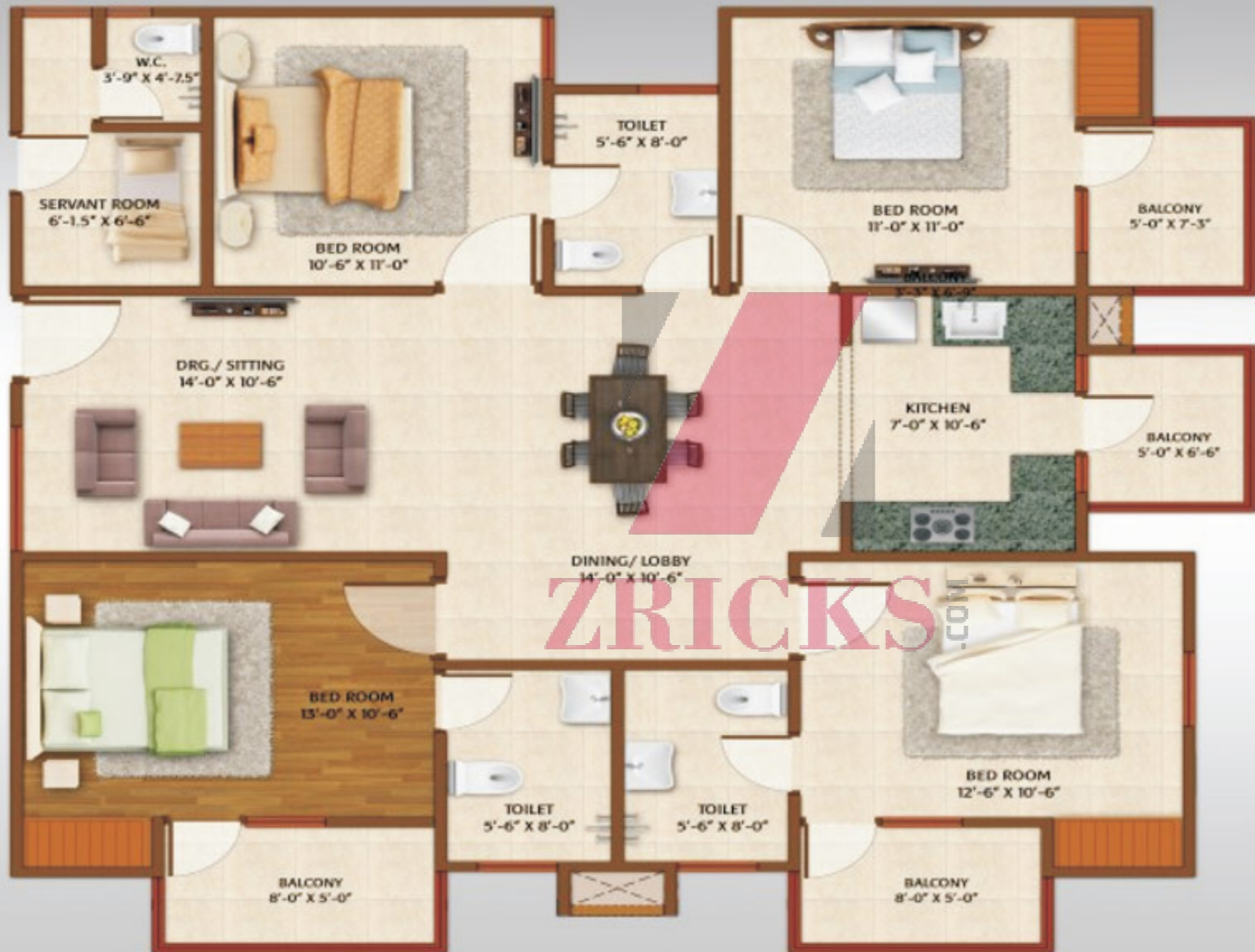
FLOOR PLAN : 4 BHK Super Area 1800 Sq. Ft.