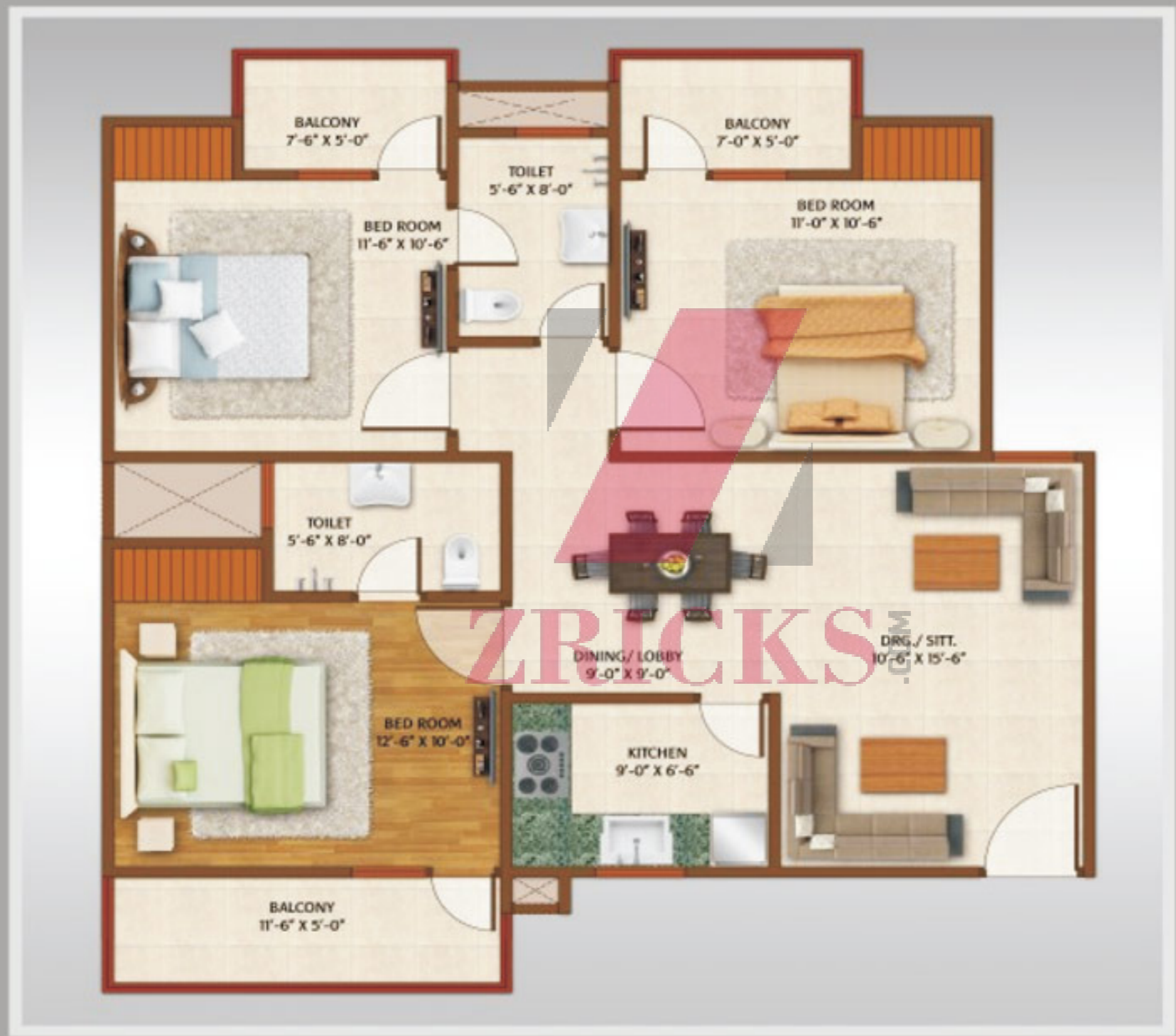
FLOOR PLAN : 3 BHK Super Area : 1225 Sq.Ft.