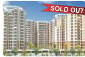
KLJ HEIGHTS Sector 15, Bahadurgarh