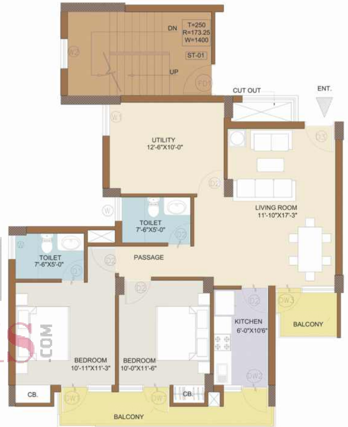
3 Bedroom - 1266 sq. Ft.