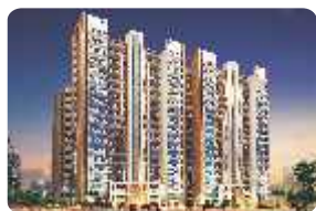
KLJ PINNACLE Sector-77, Faridabad