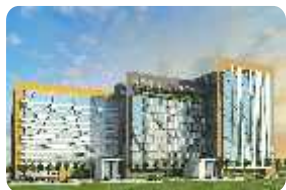
NOIDA ONE Sector 62, Noida