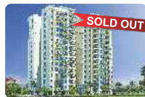
VEDANTA Sector-15, Bahadurgarh