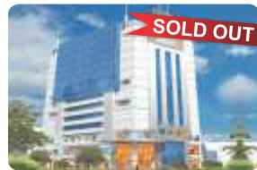
KLJ TOWER North Delhi