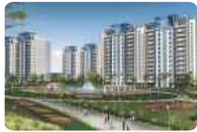
KLJ GREENS Sector 77, Faridabad