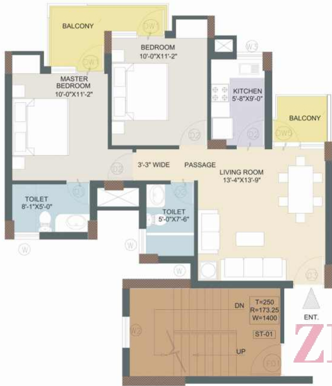
2 Bedroom - 930 sq. Ft.