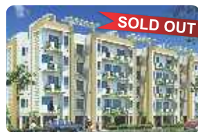
NAKSHATRA Sector-15, Bahadurgarh