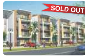
PLATINUM FLOORS Sector 77, Faridabad