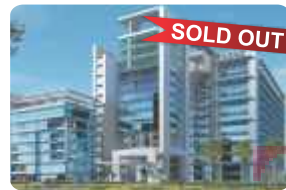
PARK CENTRA Gurgaon