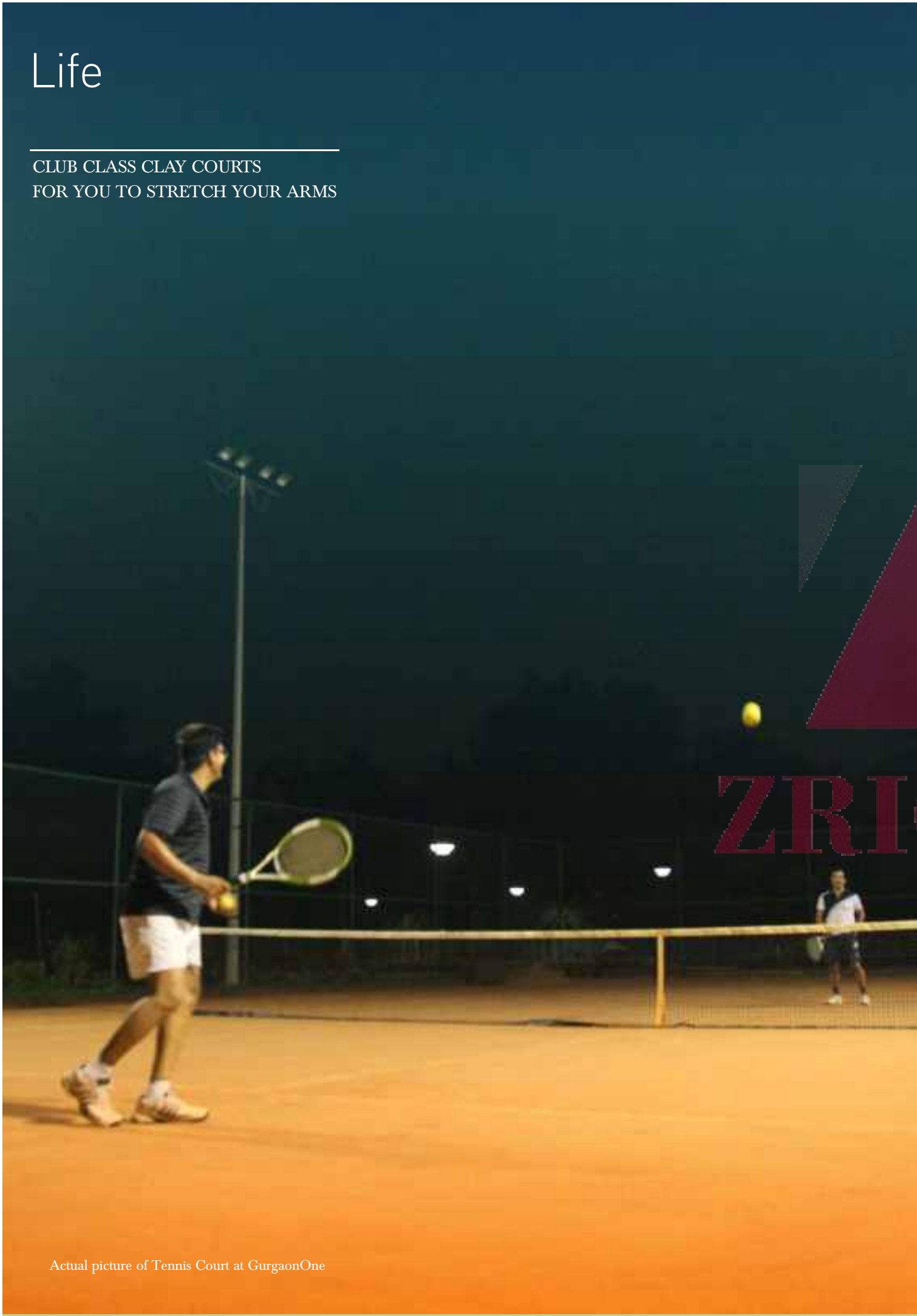
Actual picture of Tennis Court at GurgaonOne

CLUB CLASS CLAY COURTS FOR YOU TO STRETCH YOUR ARMS