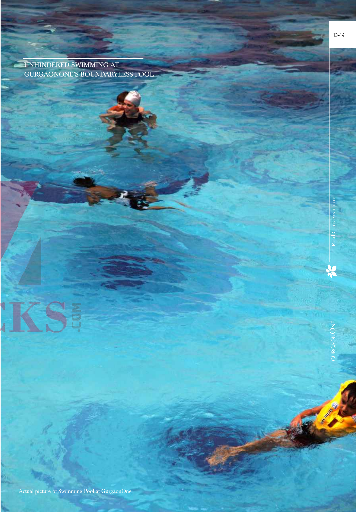
Actual picture of Swimming Pool at GurgaonOne

UNHINDERED SWIMMING AT GURGAONONE'S BOUNDARYLESS POOL