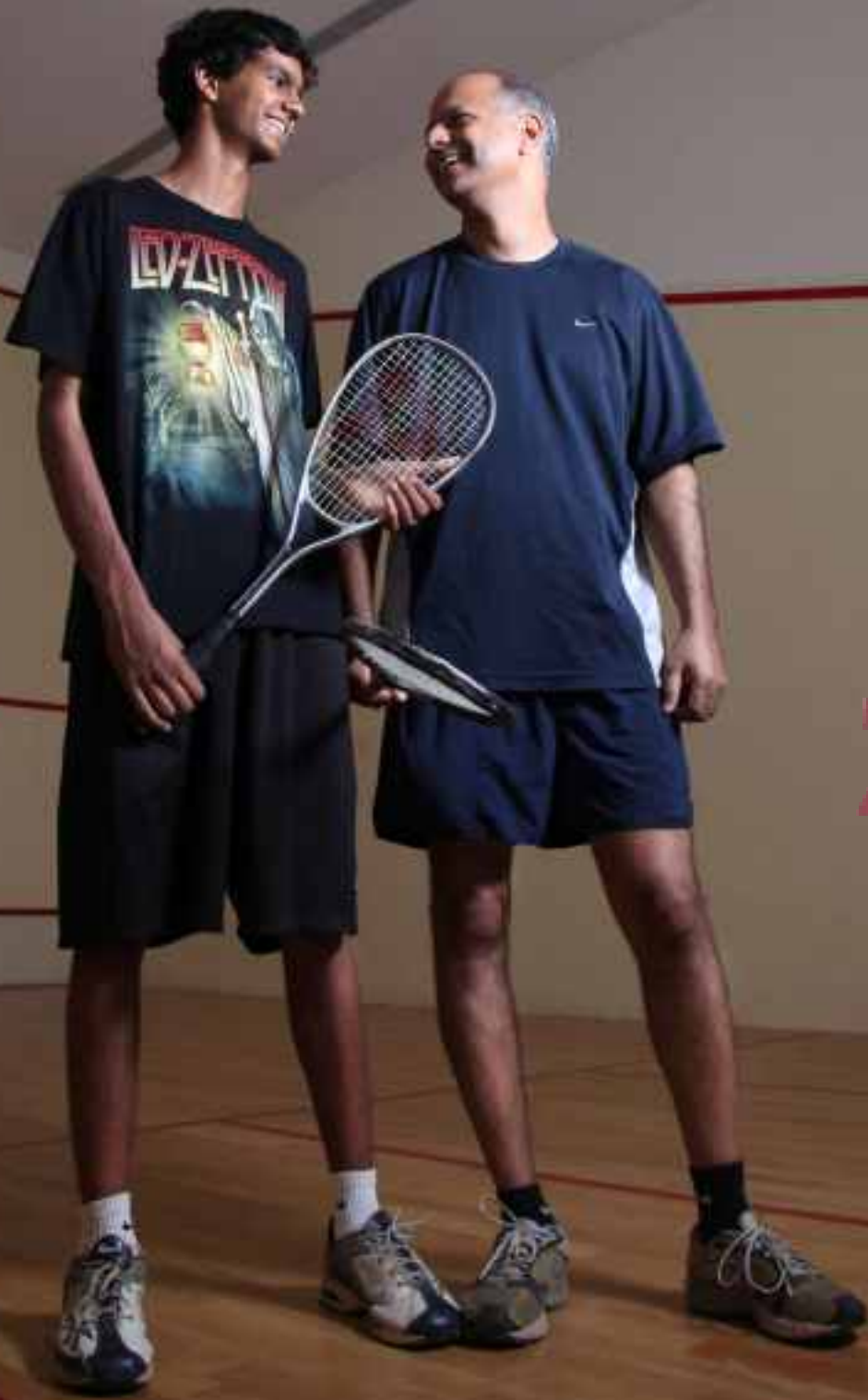
Actual picture of Squash Court at GurgaonOne

BONDS MADE OVER SQUASH, HARDENED AT STEAM & SAUNA.