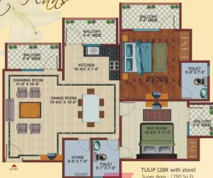
TULIP (2BR with store) Super Area : 1290 Sq.Ft.