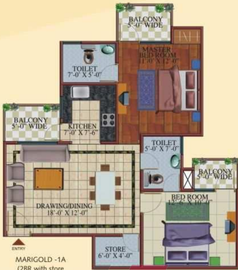
MARIGOLD -1A (2BR with store) Super Area : 1140 Sq.Ft.)