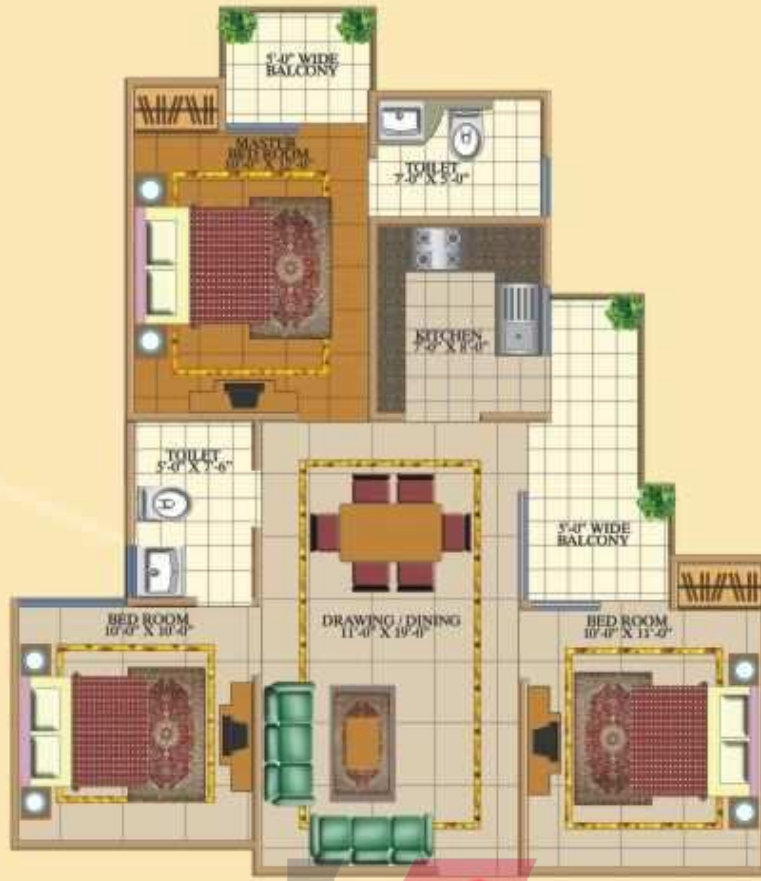
ENTRY GOKUL-1A (3BR) Super Area : 1185 Sq.Ft.