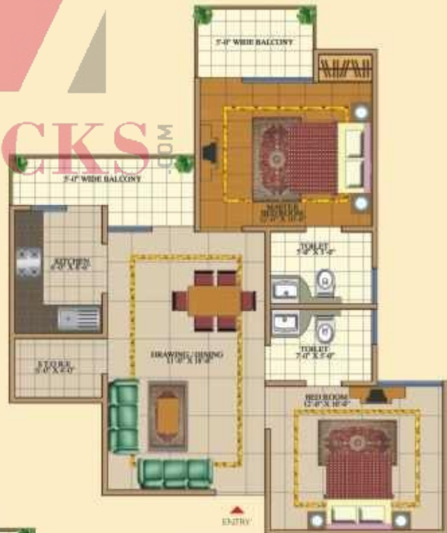
PURI-1A (2BR with store) Super Area : 1000 Sq.Ft.