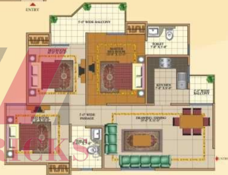
DWARKA-1 (3BR) Super Area : 1310 Sq.Ft.