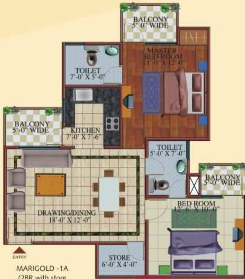
MARIGOLD -1A (2BR with store) Super Area : 1140 Sq.Ft.)