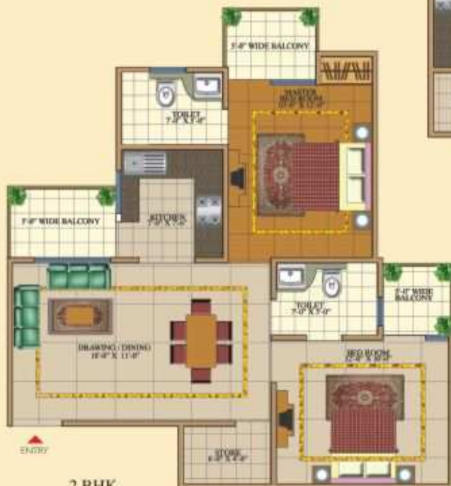
2 BHK PURI-1 (2BR with store) Super Area : 1000 Sq.Ft.