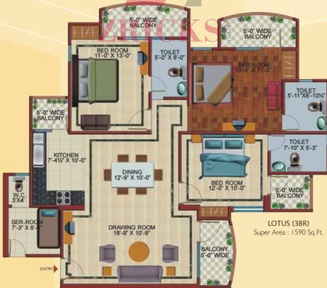
LOTUS (3BR) Super Area : 1590 Sq.Ft.