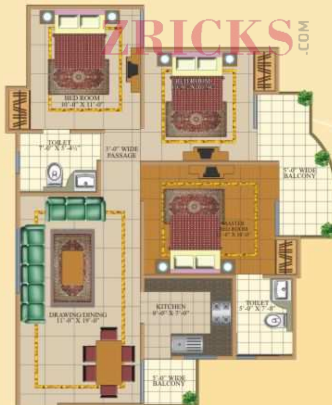
ENTRY GOKUL-1 (3BR) Super Area : 1215 Sq.Ft.