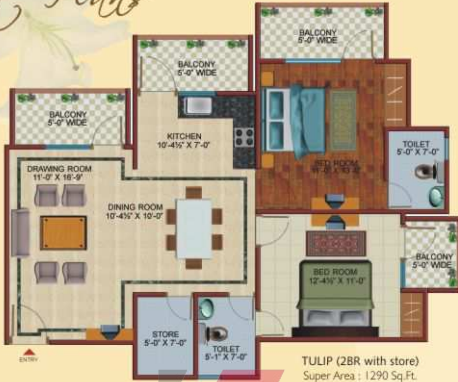
TULIP (2BR with store) Super Area : 1290 Sq.Ft.