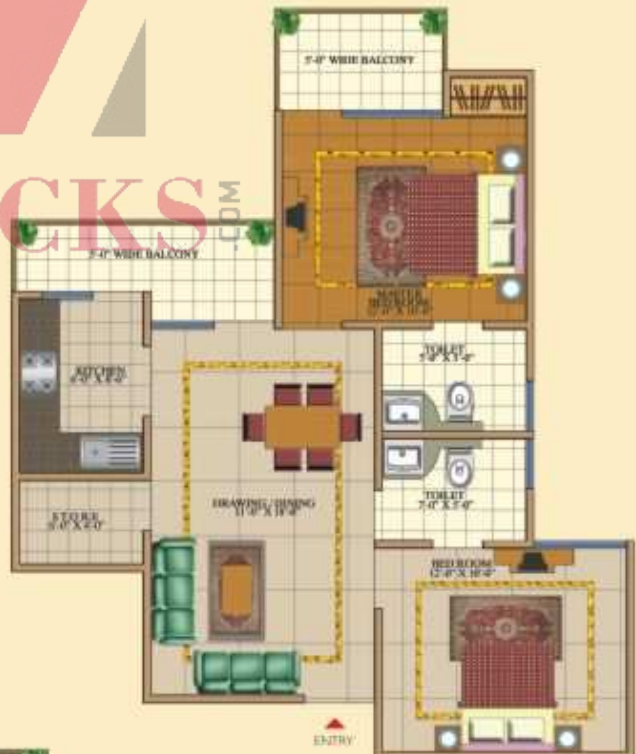
PURI-1A (2BR with store) Super Area : 1000 Sq.Ft.