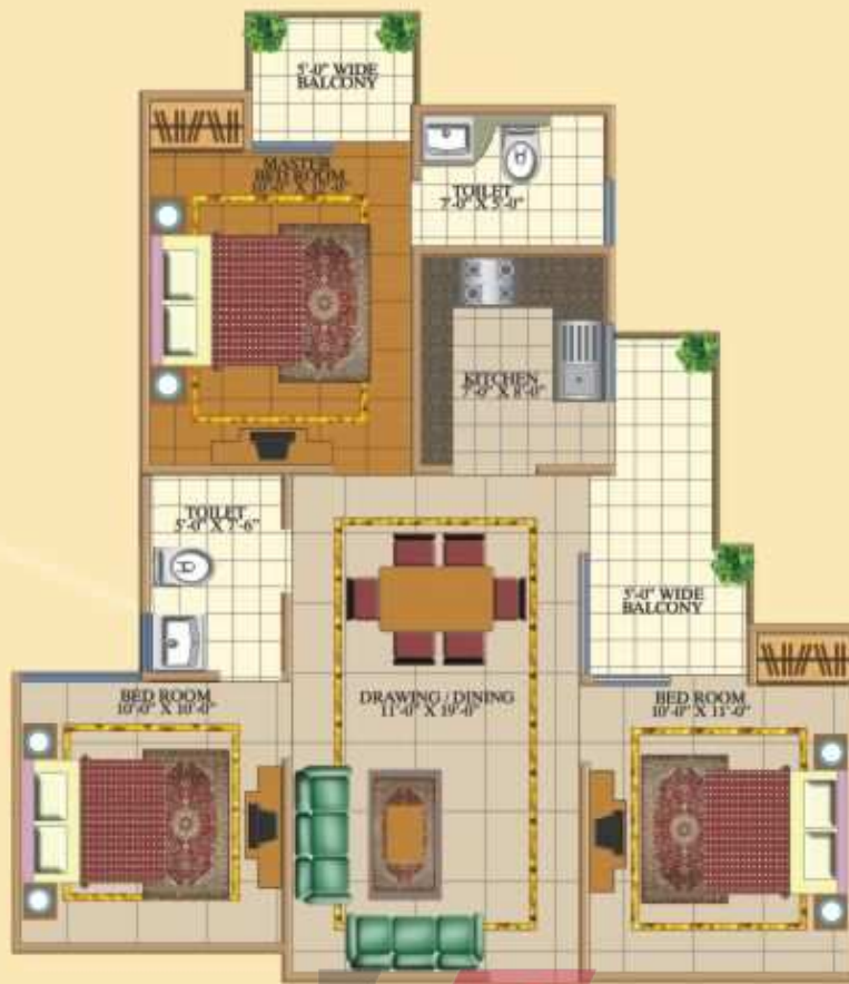
ENTRY GOKUL-1A (3BR) Super Area : 1185 Sq.Ft.