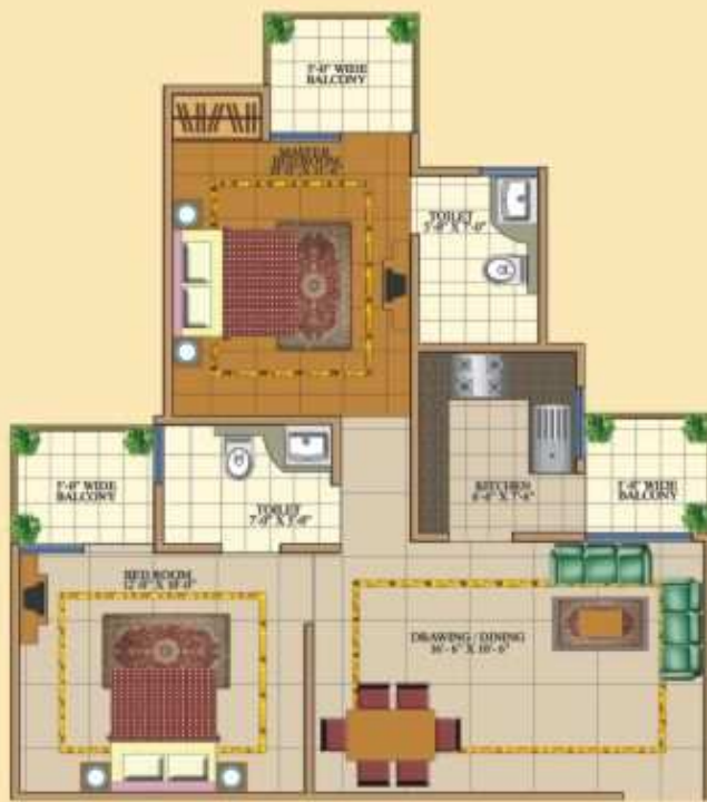
DWARKA (2BR) Super Area :950 Sq.Ft.