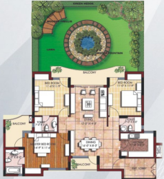
ALCOVE 3 Bedroom without servant Villa

Total Area: 2415 sqft (including lawn area) approx.