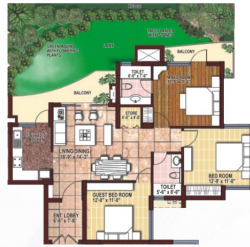
PATIO Cozy 3 Bedroom Villa

Total Area: 2200 sqft (including lawn area) approx.