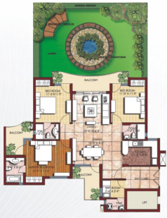
ALCOVE 3 Bedroom with servant Villa

Total Area: 2540 sqft (including lawn area) approx.