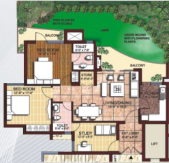
PATIO 2 Bedroom Villa

Total Area: 1920 sqft (including lawn area) approx. Note: 1 Sq. Mt. = 10.764 Sq. Ft. approximately