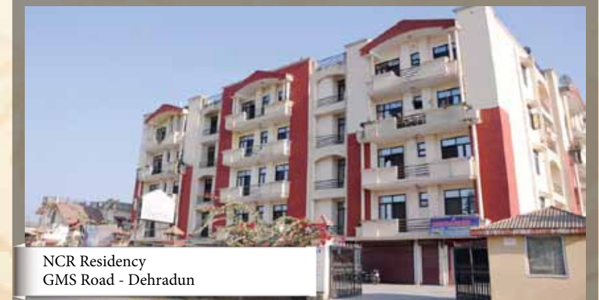
NCR Residency GMS Road - Dehradun