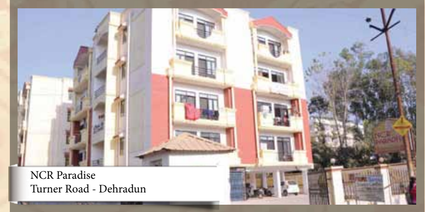
NCR Paradise Turner Road - Dehradun