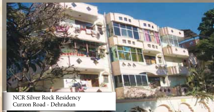
NCR Silver Rock Residency Curzon Road - Dehradun