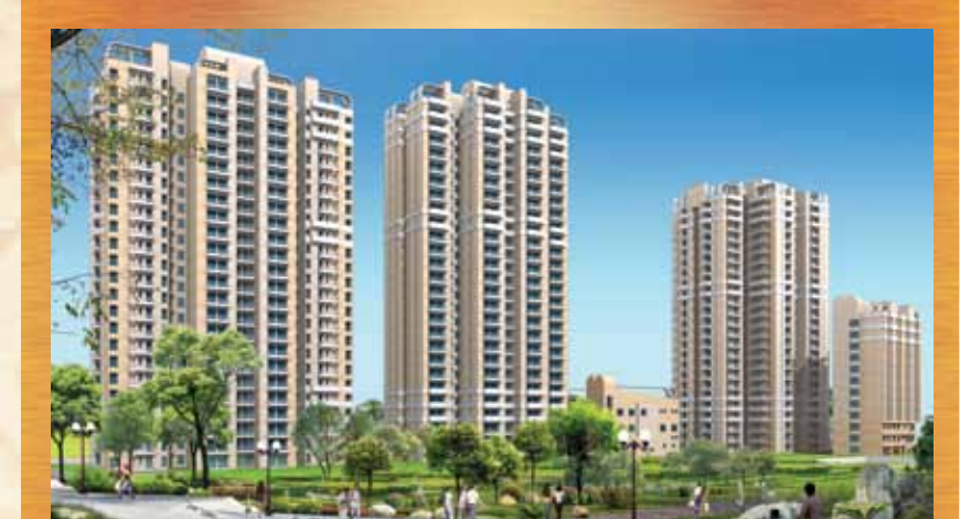
NCR MONARCH 1, 2 & 3 BHK APARTMENTS Epitome of Royal Living