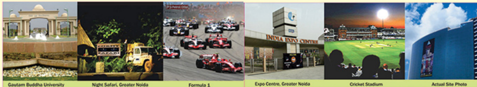
Gautam Buddha University Night Safari, Greater Noida Formula 1 Expo Centre, Greater Noida Cricket Stadium Actual Site Photo