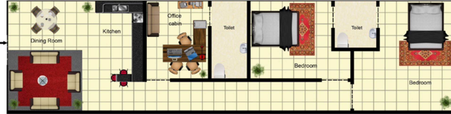
Unit Plan Total Super area for one unit type:- 2BHK + office = 1200 sq. ft.