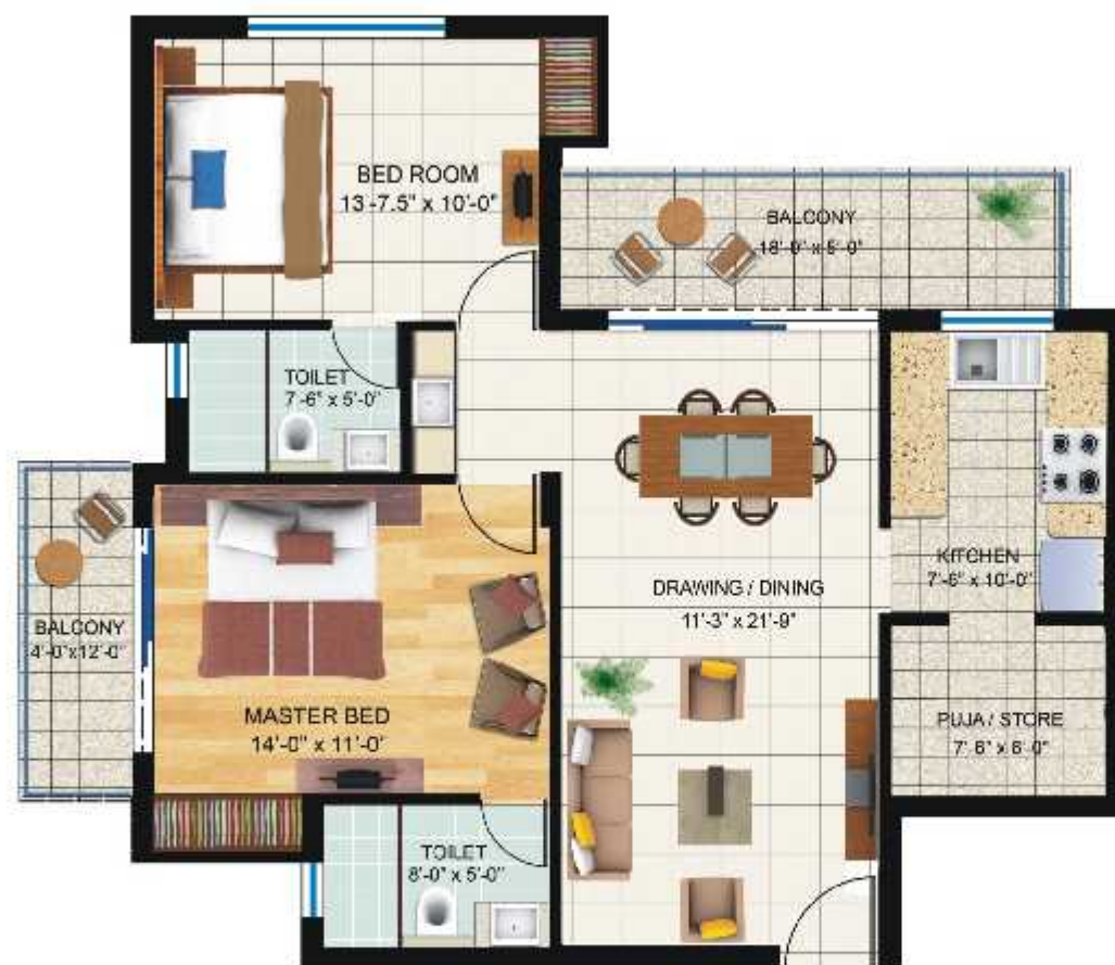
2 BHK PREMIUM SUPER AREA-1275 Sq. Ft.