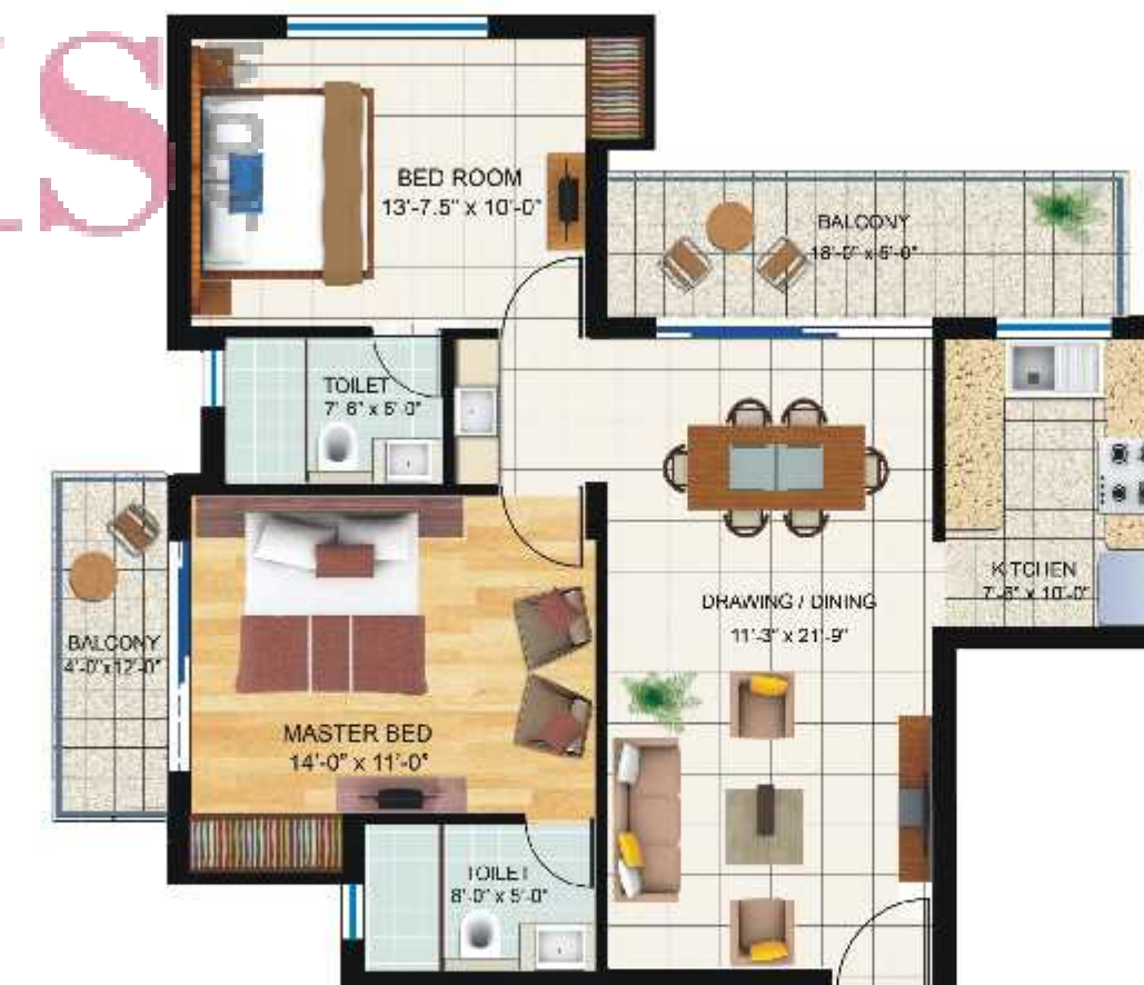
2 BHK EXECUTIVE SUPER AREA-1215 Sq. Ft.