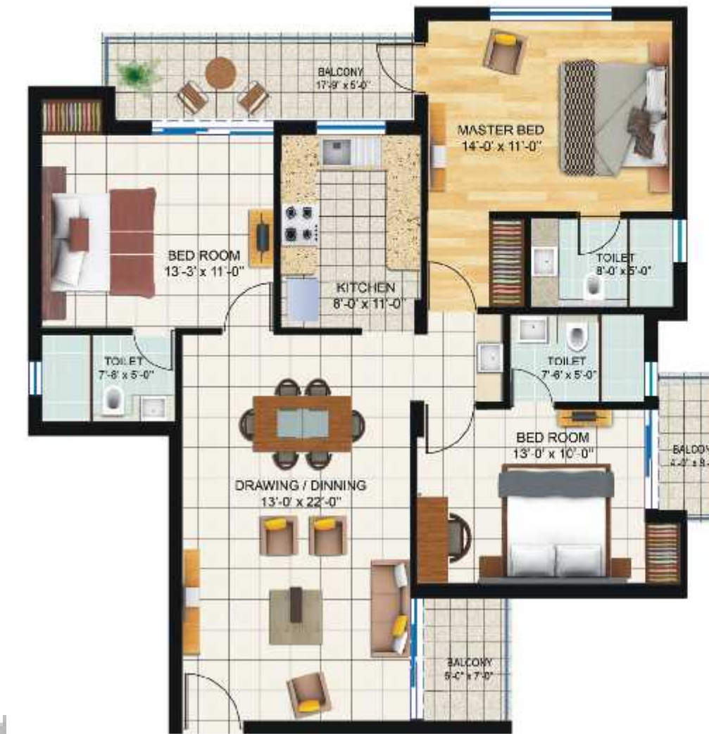
3 BHK EXECUTIVE SUPER AREA-1605 Sq. Ft.