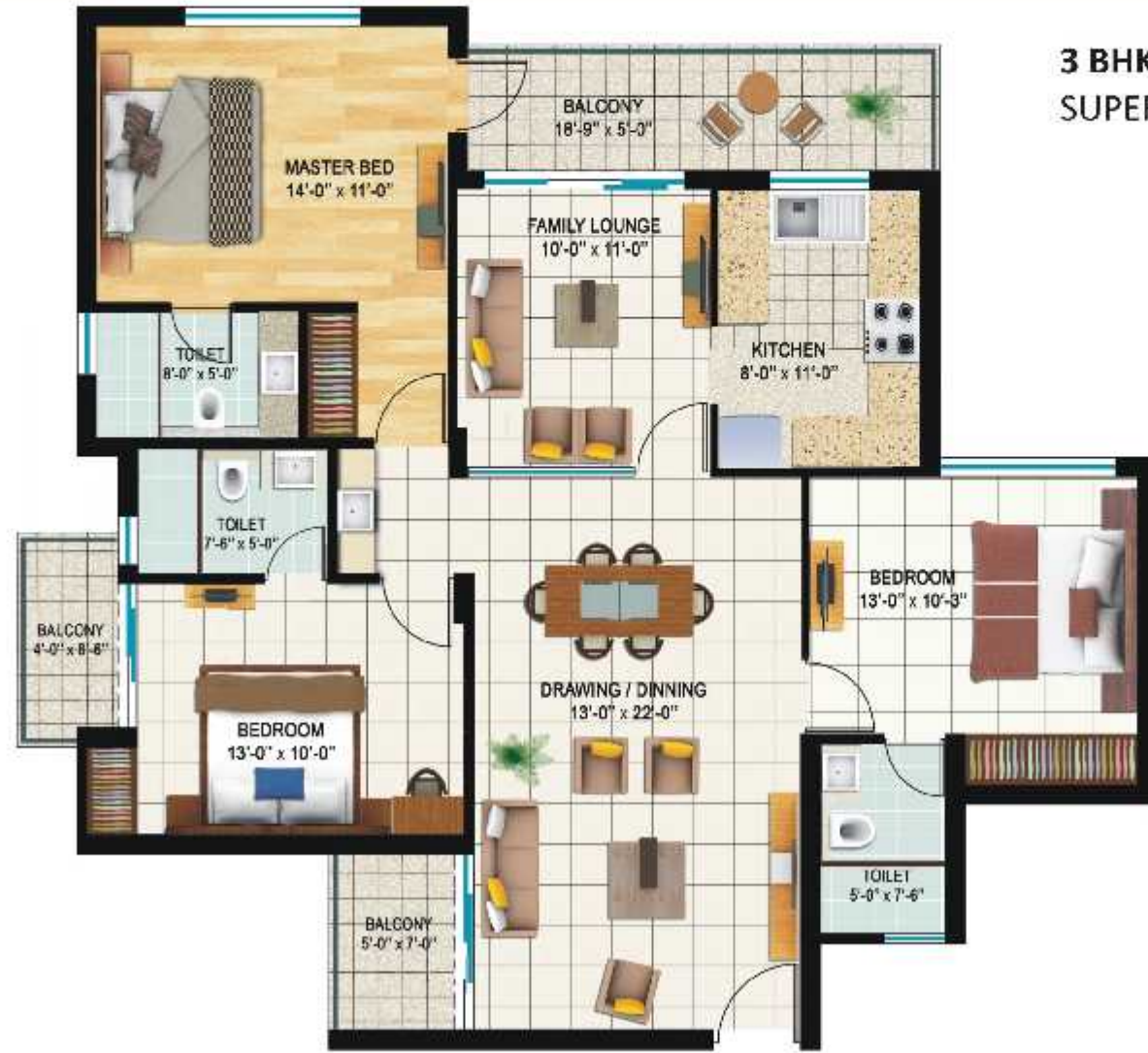
3 BHK PREMIUM SUPER AREA-1750 Sq. Ft.

ELECTRICALS BIS marked fire proof wiring with modular switches suitable for A.C. and other appliances OTHERS Two high speed elevators in each tower for passengers & luggage handling