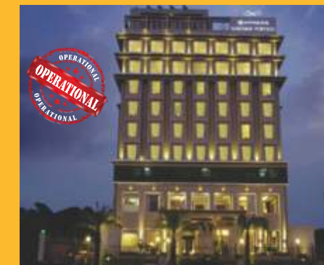
Express Sarovar Portico, Surajkund