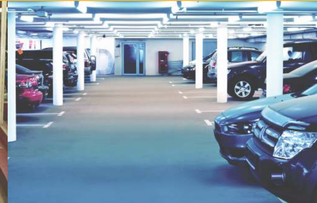
2 LEVEL BASEMENT PARKING