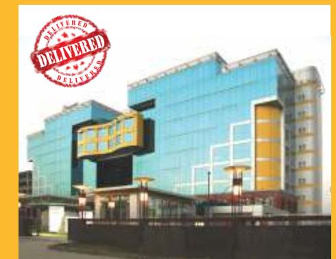
Express Trade Towers 1, Filmcity, Sec.16A, Noida