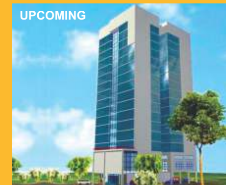
Baba Vistas, Okhla, Phase 1

Express Trade Towers 3, Sector 34, Hero Honda Crossing, NH-8, Expressway, Gurgaon