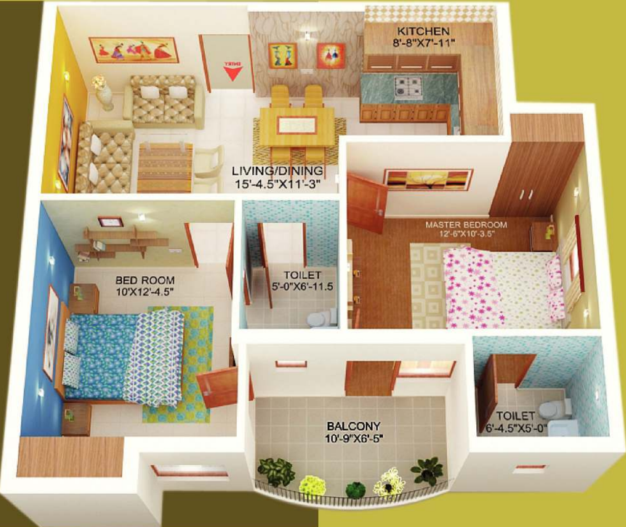
FLOOR PLAN: Type B/2BHK Super Area 965 sqft