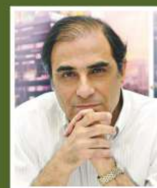
Architect HAFEEZ CONTRACTOR

I had two goals when I created the Naturez Park Blueprint. First, the homes should accomplish their practical duty of personalizing the resident's world with luxuries and necessities, and secondly, that they do so by being graceful, pleasing, and uniquely singular.