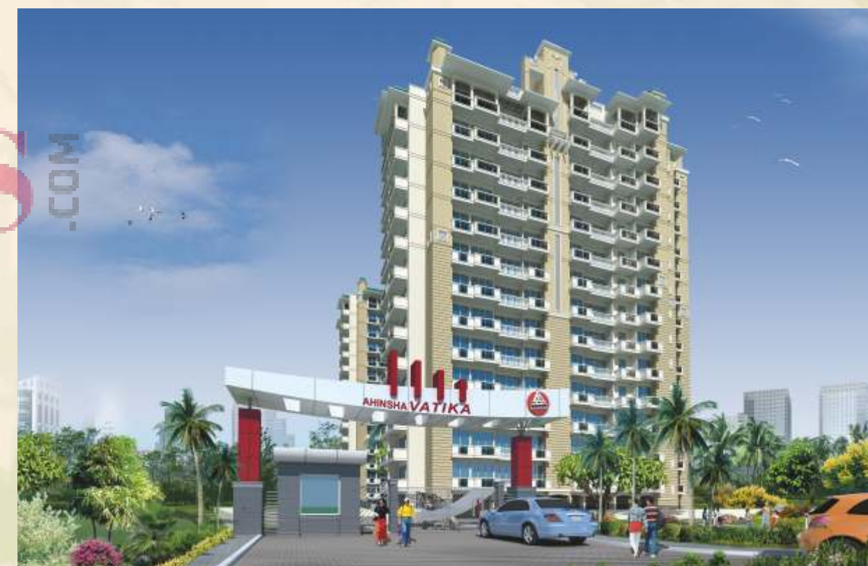
AHINSHA VATIKA - EAST DELHI

FIRE FIGHTING SYSTEM : As per approval from fire authority.