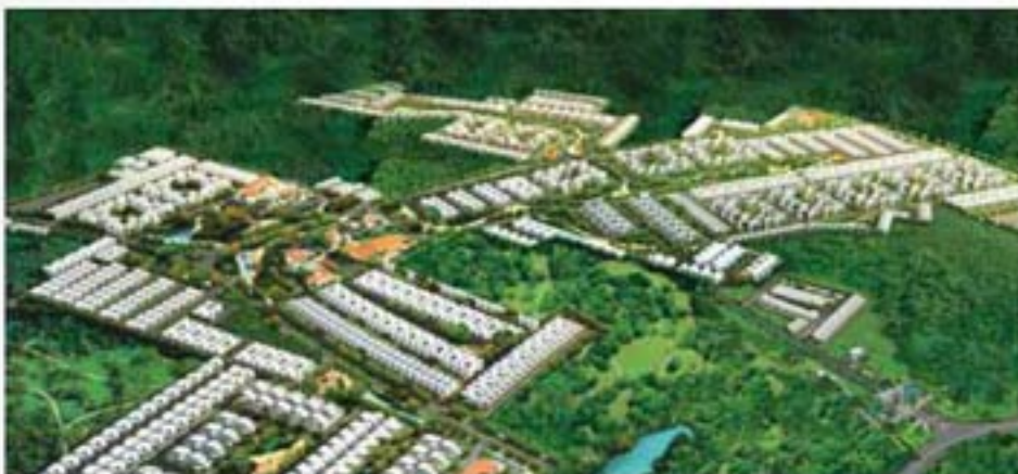
The Empyrean, Bangalore - a 243 acres, fully integrated world-class township