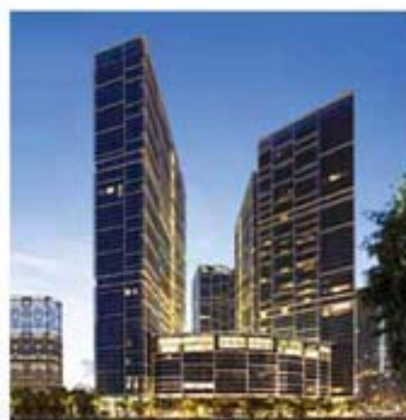
Icon Brickell Condominium