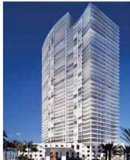
Icon South Beach