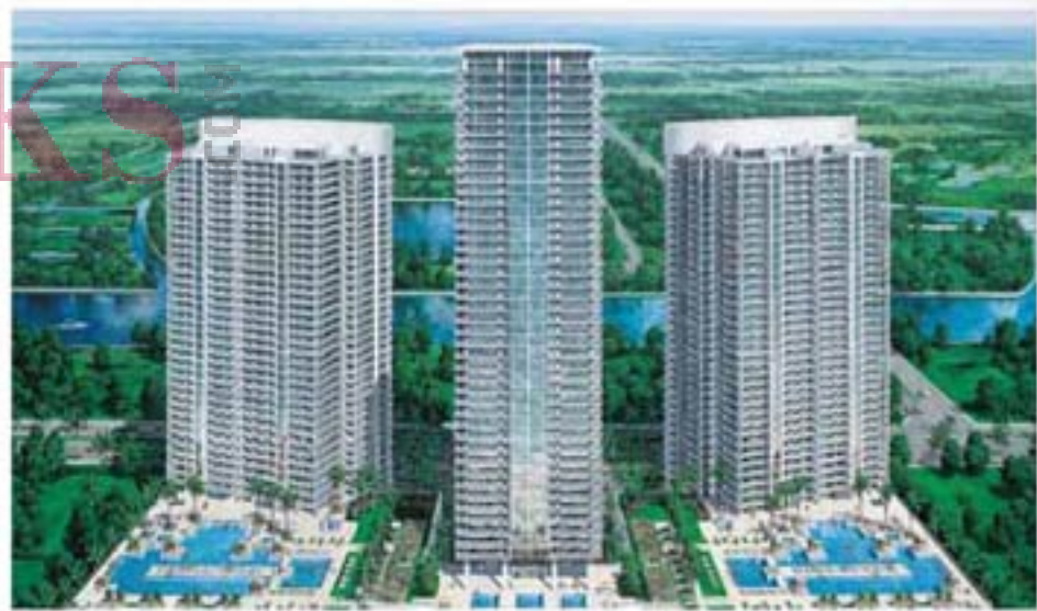
Hallandale Beach Club Tower

Related was honoured as the 2007 recipient of the prestigious Honour Award from the National Building Museum, given in recognition of its commitment to architecture and design excellence in new development.