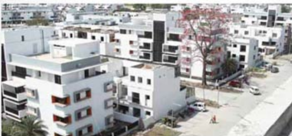
Silver Springs, Indore - a 139 acres township