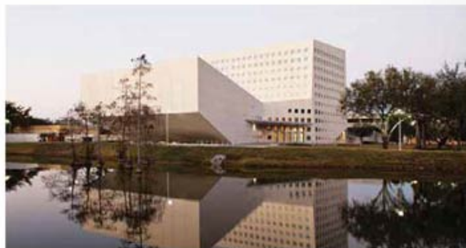
Florida International University

Today, Arquitectonica has a practice across the United States directed from regional offices in Miami, New York and Los Angeles. Arquitectonica's international practice is supported by regional offices in Paris, Hong Kong, Shanghai, Manila, Dubai, Lima and Sao Paulo.