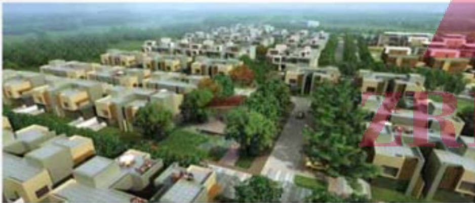
The Empyrean, Nagpur - a 152 acres, self-sufficient township

Stanza Developers & Infrastructure Pvt. Ltd. is promoted by a leading industrialist family of Panipat/NCR region. The group has business interests across India and abroad in textiles and real estate, among other sectors. The group has a wide base of international clientele and stands for strong integrity, commitment to customers and society. Stanza Developers & Infrastructure Pvt. Ltd. is a real estate venture of the group, which is committed to improving urban infrastructure of Panipat by delivering world-class real estate products. The promoter group, with its firm roots in Panipat, has the reputation of bringing cutting-edge products and innovation in the textile industry. Stanza endeavours to achieve similar success in the real estate sector by delivering products that redefine the lifestyle of the people.