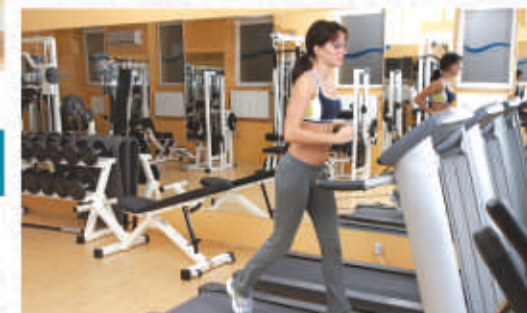
MULTIPURPOSE CLUB HOUSE