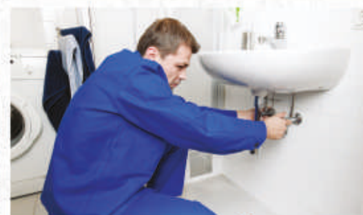
24X7 MAINTENANCE STAFF