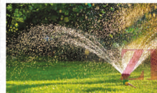
RECYCLE OF WASTE WATER