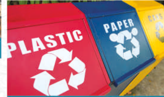
SYSTEMATIC WASTE DISPOSAL