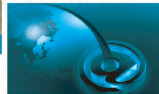
WI-FI ENABLED COMPLEX