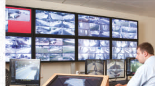
CUTTING EDGE SECURITY