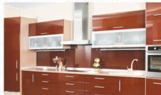
IMPORTED MODULAR KITCHEN