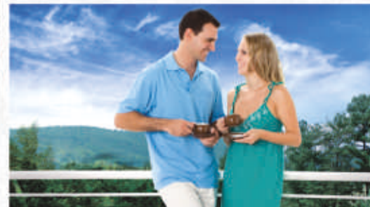
ALL APARTMENTS 3 SIDE CORNER WITH PRIVATE BALCONIES