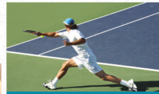
MULTIPURPOSE BASKET BALL & TENNIS COURT