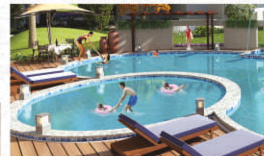
SWIMMING POOL WITH JACUZZI