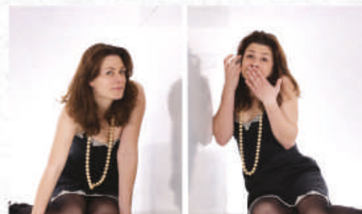
NO COMMON WALLS