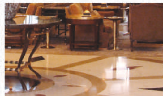
ITALIAN / IMPORTED MARBLE