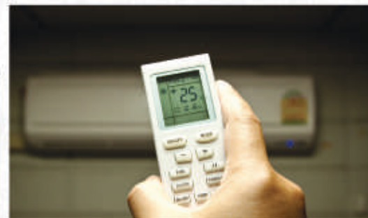
FULLY AIR CONDITIONED