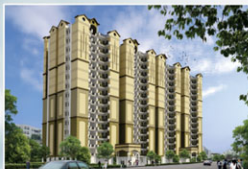
EKDANT DRONAGIRI Vasundhara, (Gzb.)