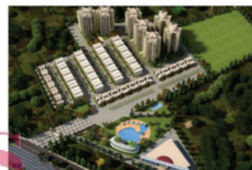
EKDANT Palace Meerut

To know more about our completed projects visit to our website