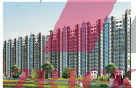
EKDANT Rawal Residency Greater Noida