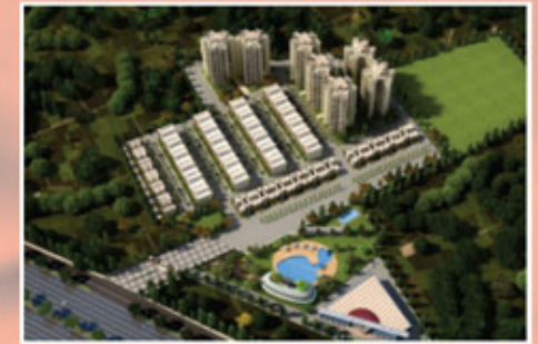
EKDANT Palace Meerut

To know more about our completed projects visit to our website