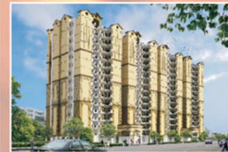
EKDANT Dronagiri Vasundhara