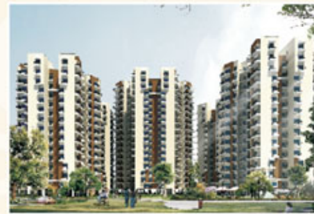
EKDANT FNG Greater Noida