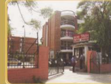
Kala Vihar Apartments Mayur Vihar Phase - I, New Delhi Consisting 140 Units