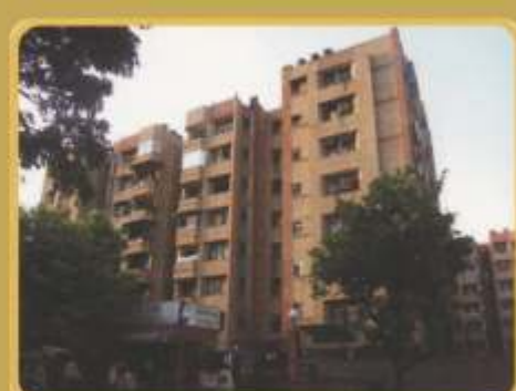
DSIDC Co-operative Apartments Plot 23, Sec - 9, Rohini Delhi Consisting 135 units