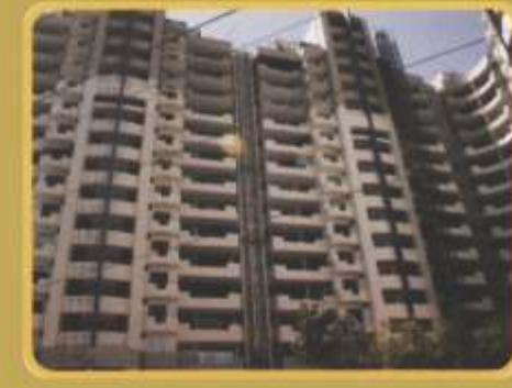
APEX Green Valley Sec - 9, Vaishali, Ghaziabad Consisting 123 Nos. of Supper HIG Appts.