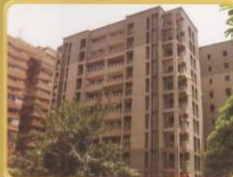
Media Times Sehkar Awas Apartments Abhay Khand - 4 Indirapuram, Ghaziabad Consisting 128 Units