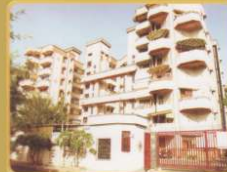
New Adarsh Apartments Plot - 22, Sector - 10, Pappan Kala, Dwarka, New Delhi, Consisting 79 Units