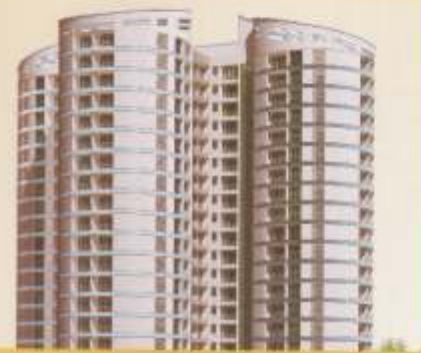
Apex Acacia Valley Sec - 3, Vaishali, Ghaziabad