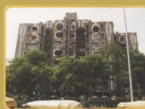
Arur Co-operative Apartments Plot 10, Mayur Vihar Phase 1, Delhi Consisting 91 Units