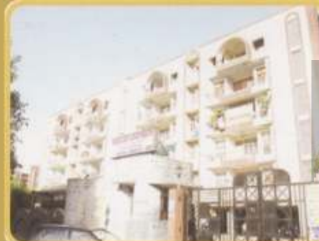
Anuradha Sehkar Awas Apartments Plot 1, Sector - 3 Indirapuram, Ghaziabad Consisting 80 Units