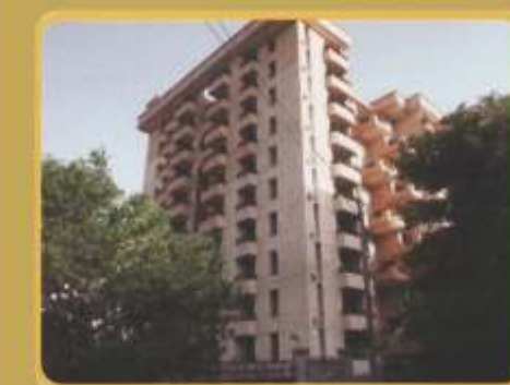
Khattar Co-operative Apartments Consisting 100 units