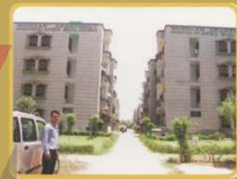
Vardan Sehkar Awas Apartments Abhay Khand - 3 Indirapuram, Ghaziabad Consisting 88 Units