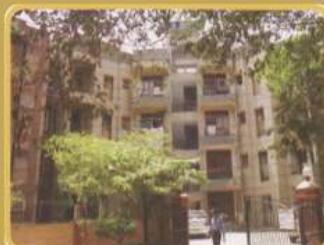
Nanda Devi Apartments Plot - 19, Sector - 10, Pappan Kala, Dwarka, New Delhi, Consisting 75 Units