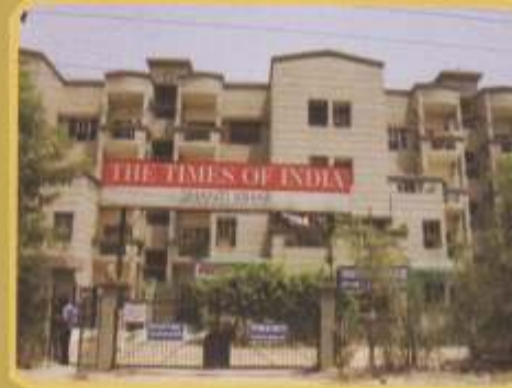
Shanti Sehkar Awas Apartments Abhay Khand - 3 Indirapuram, Ghaziabad Consisting 48 Units