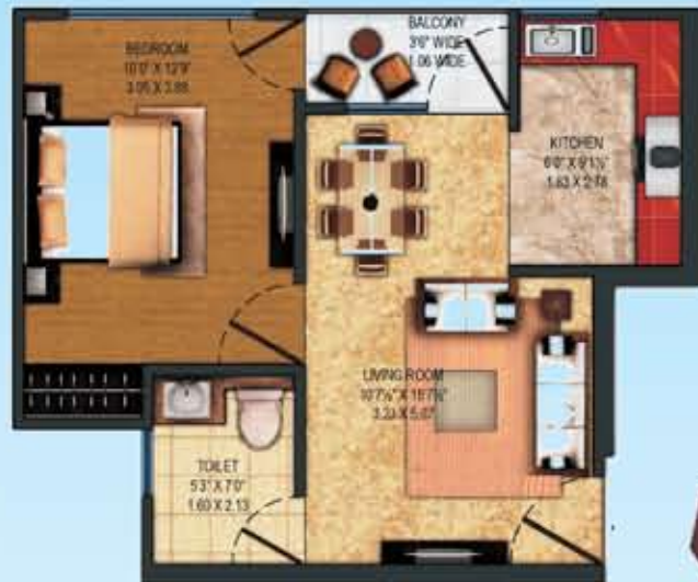
LIG UNIT TYPICAL LAYOUT PLAN (Super area = 600 sqft.)