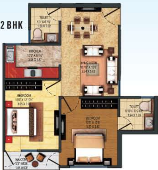
MIG UNIT TYPICAL LAYOUT PLAN (SUPER AREA = 900 SQFT.)