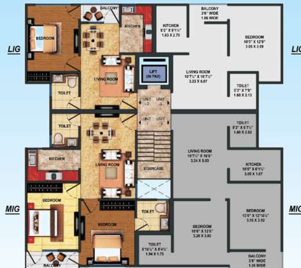
TYPICAL BLOCK LAYOUT PLAN