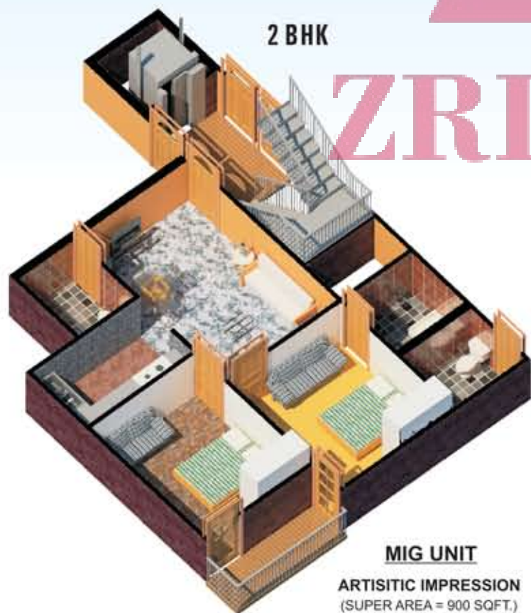
MIG UNIT ARTISITIC IMPRESSION (SUPER AREA = 900 SQFT.)