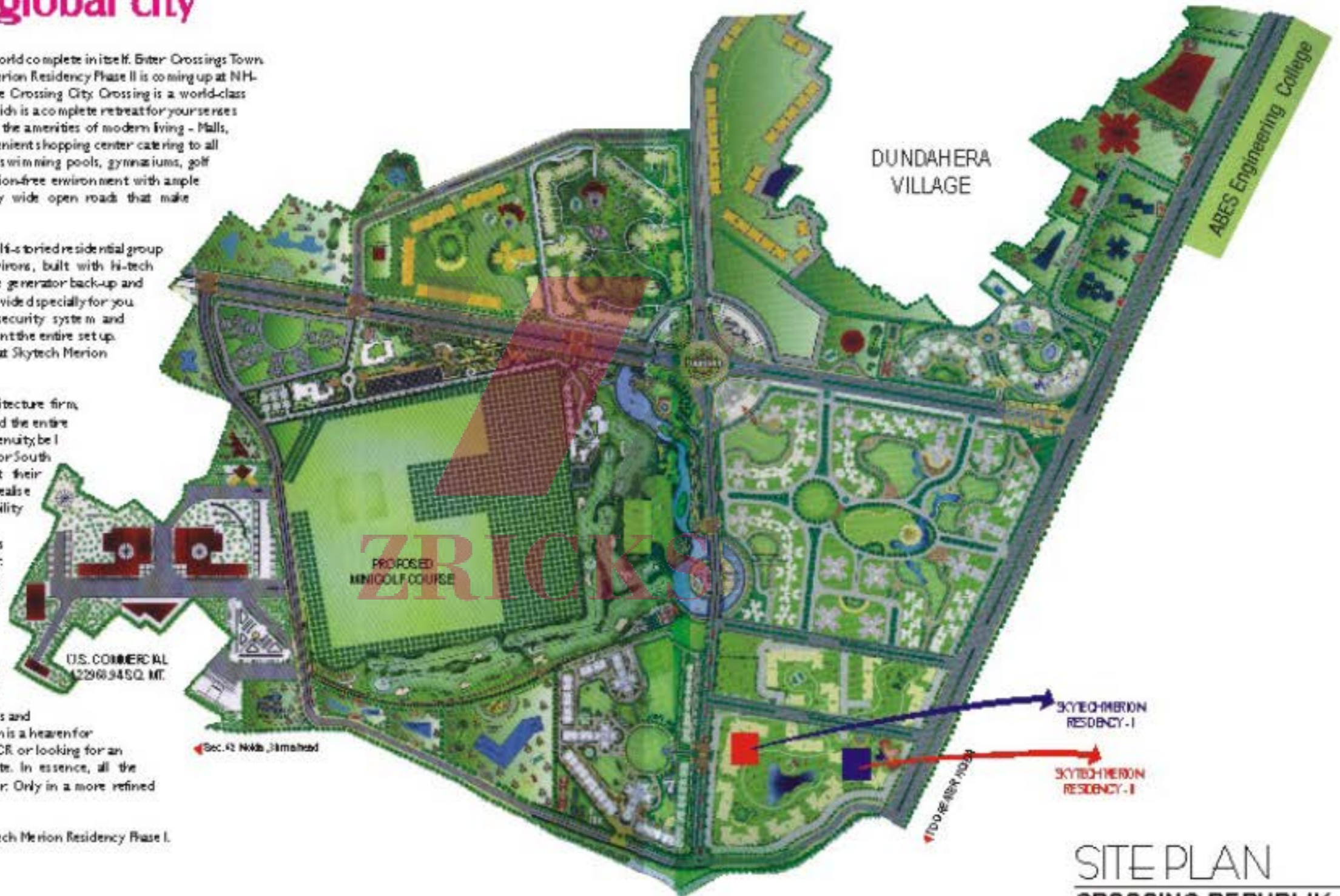
SITE PLAN CROSSING REPUBLIK

And in the lap of this luxury rests Skytech Merion Residency Phase I.