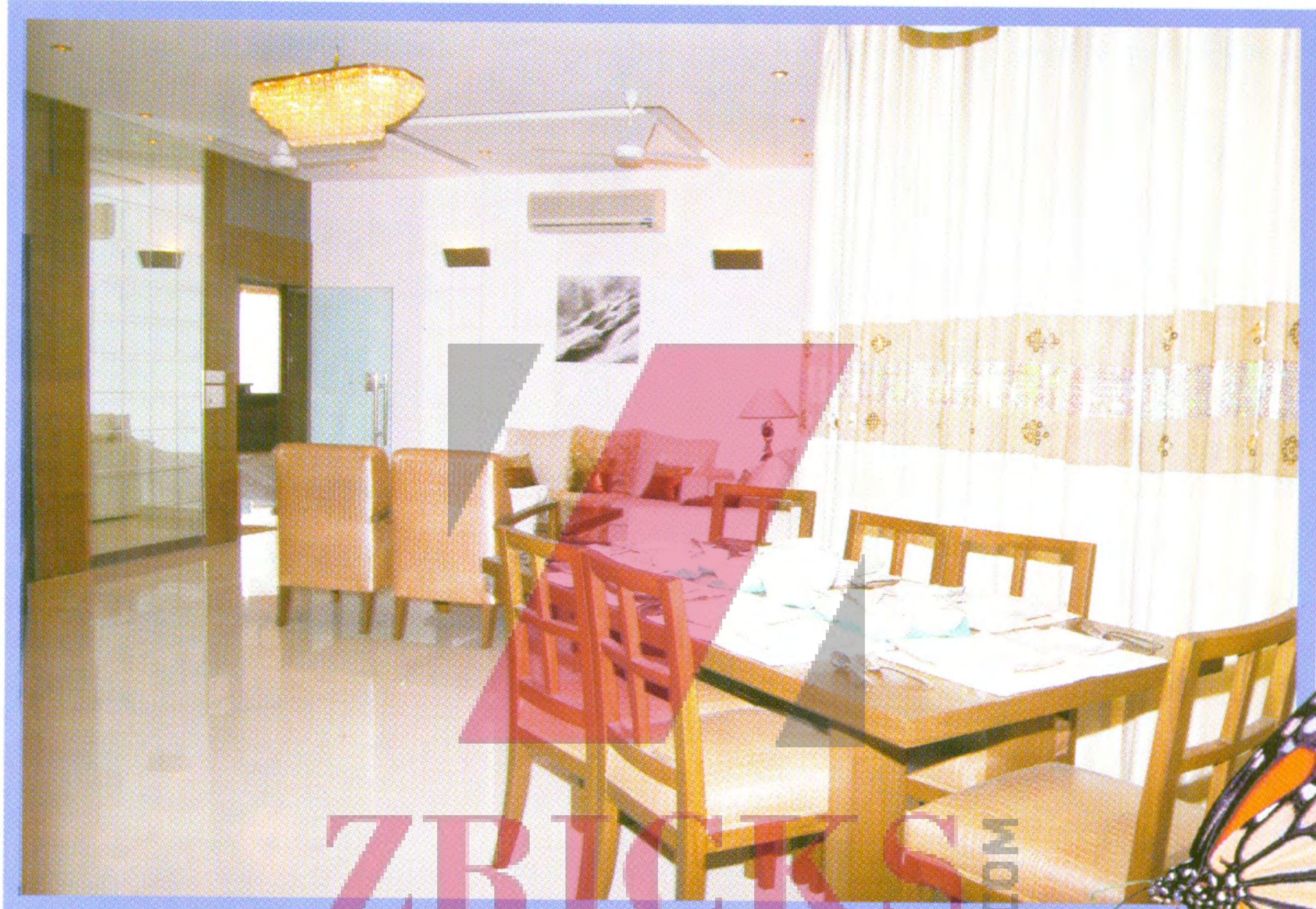
Actual Photograph of Sample Flat