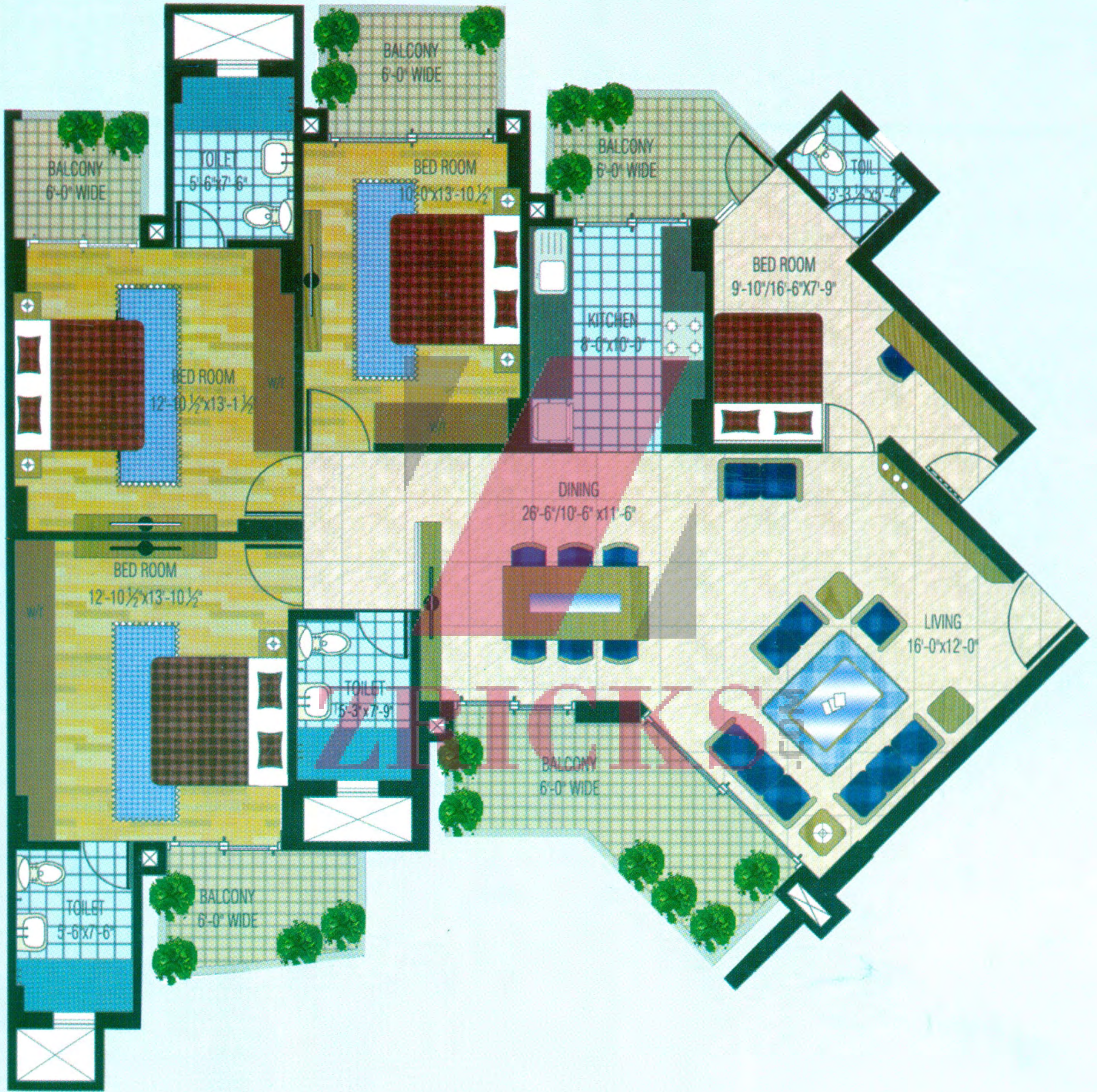
Unit Plan 3 Area 1915 sq. ft.