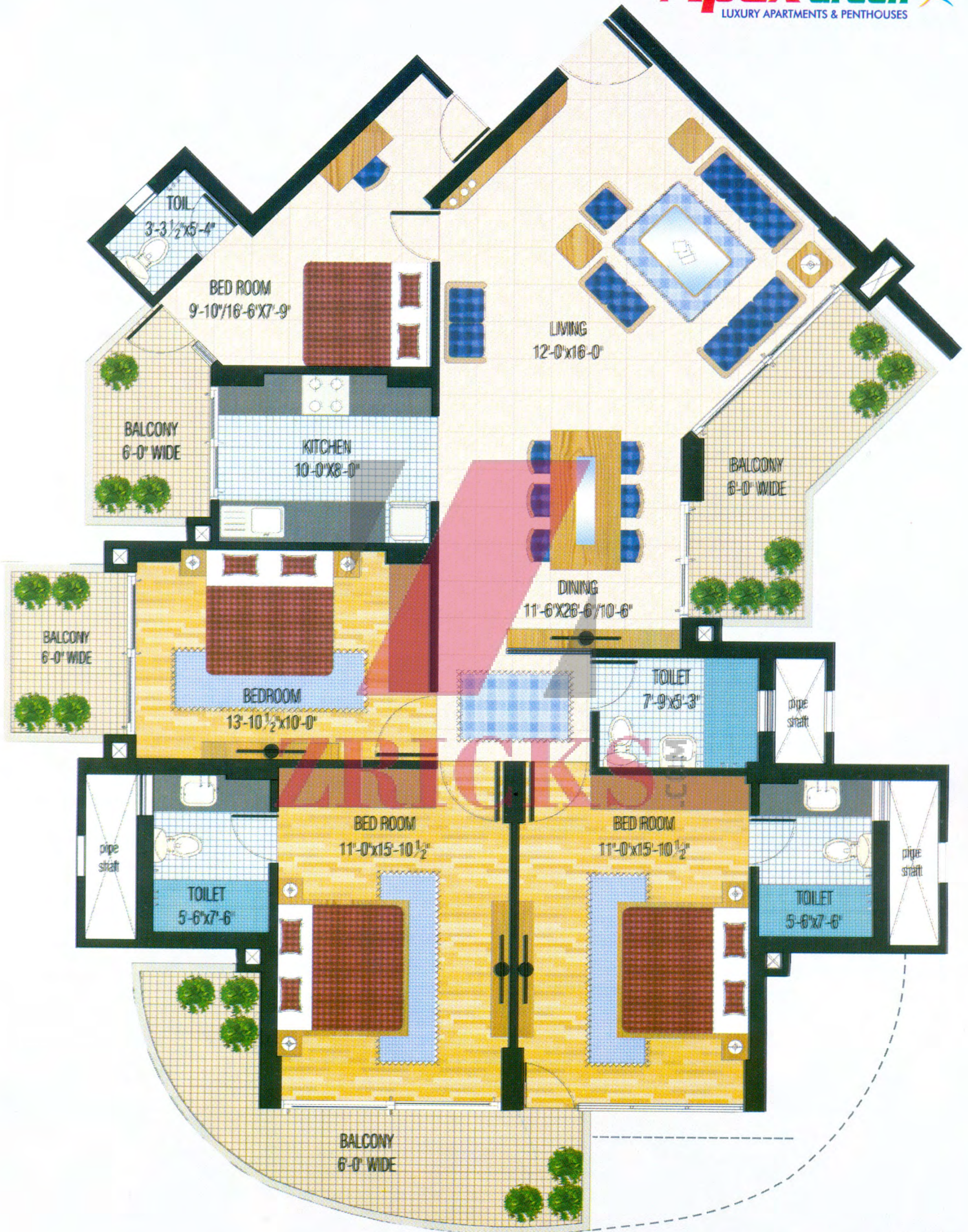
Unit Plan 1 Area 1975 sq. ft.