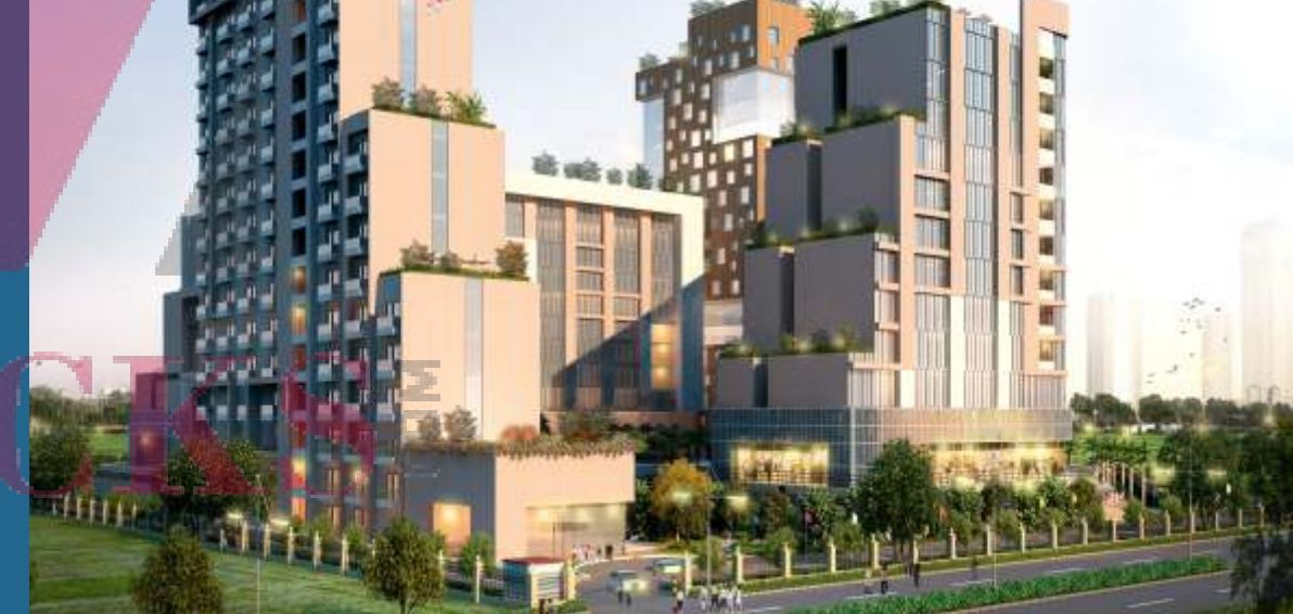
"A new Heavenly Business Destination"