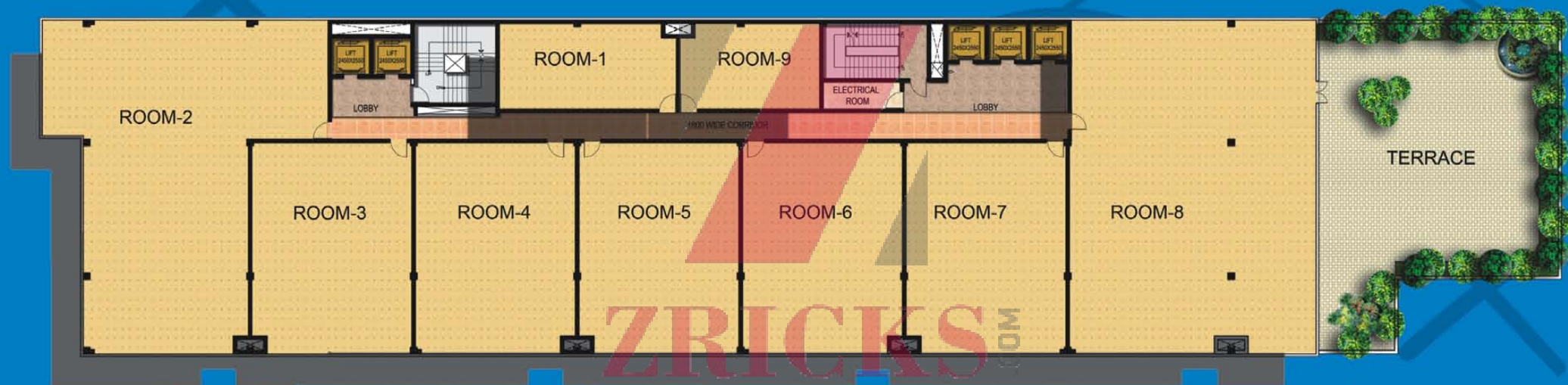
8th Floor Plan