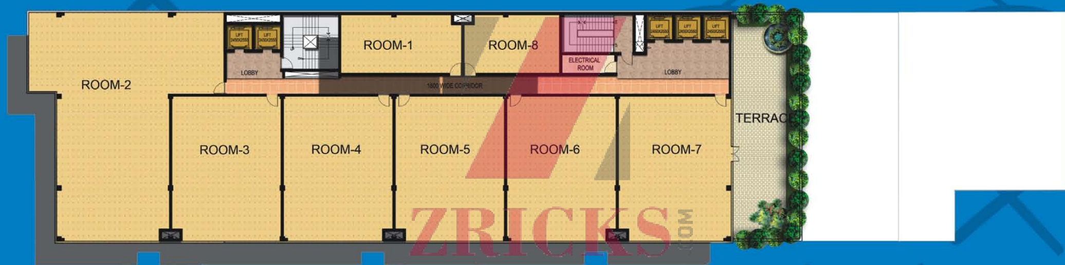
10th Floor Plan