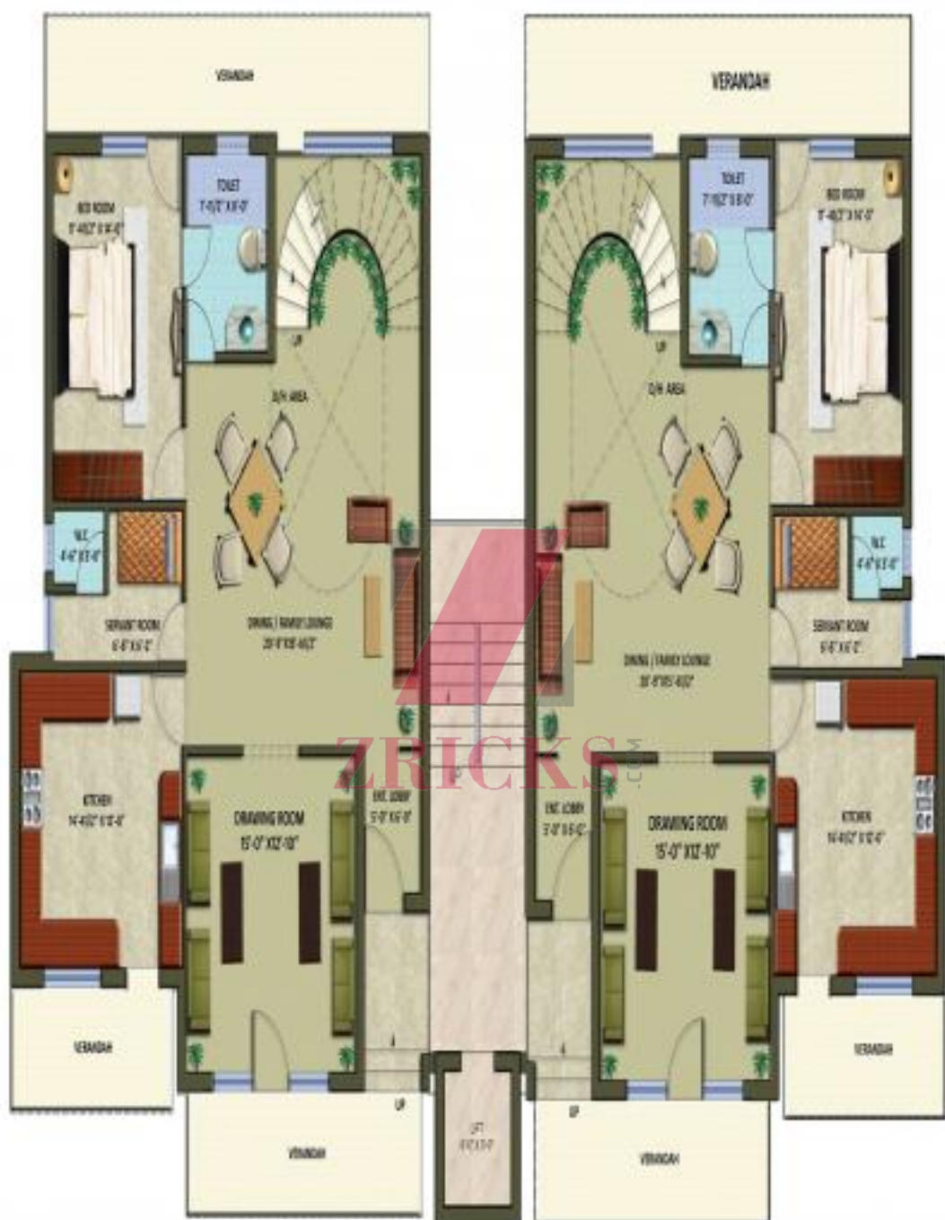
DUPLEX - GROUND FLOOR