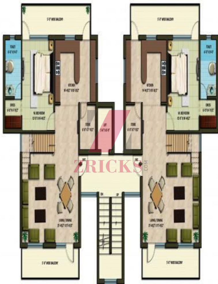
3 BHK PENT HOUSE_LOWER LVL