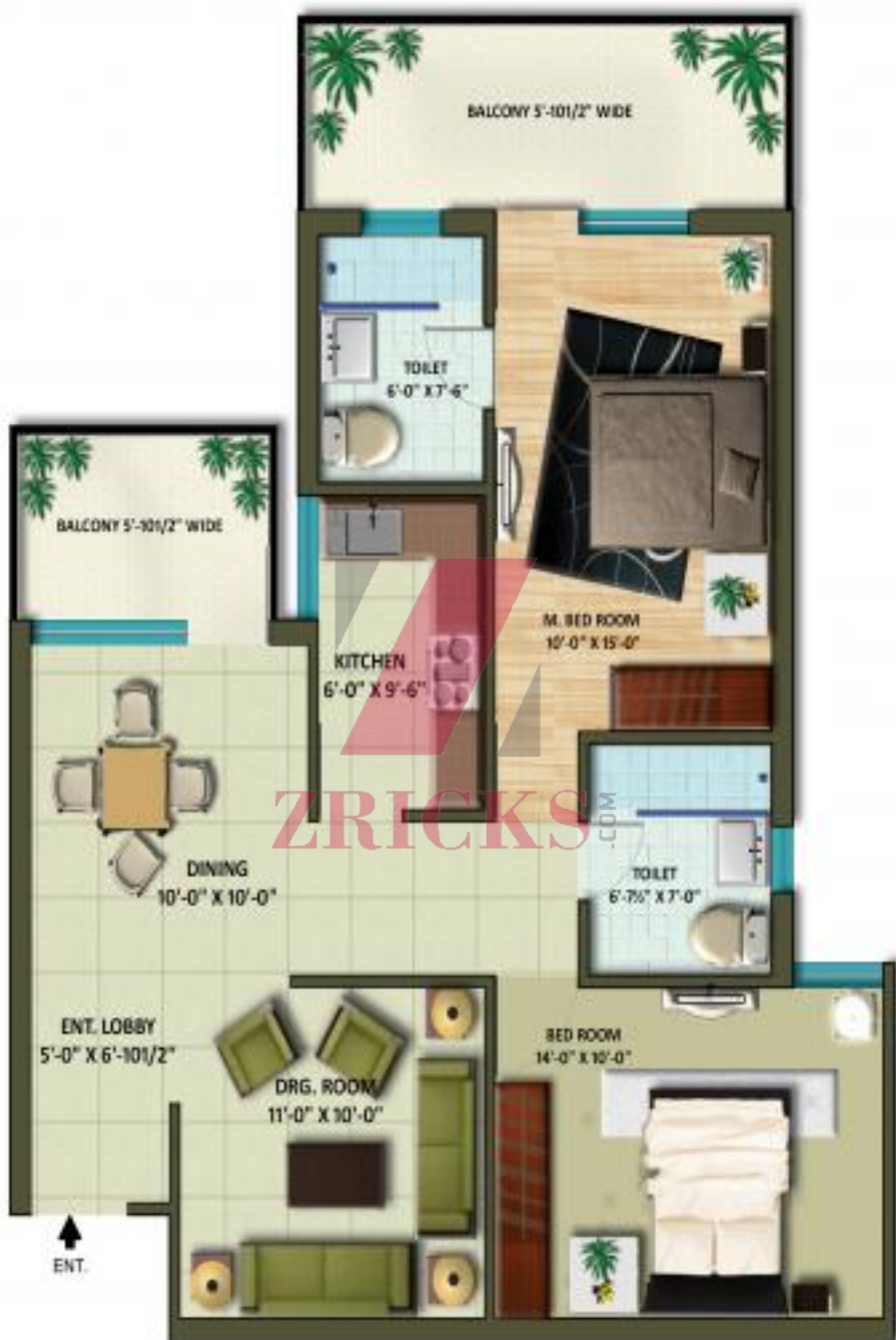
2 BHK UNIT PLAN (TYPE A) AREA = 1265 SQFT FOR MARKETING PURPOSE ONLY