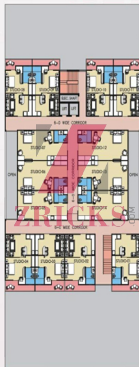
typical floor plan

area details: studio (01-04) : 690 sq. ft. studio (05-07), (12-14) 640 sq. ft. studio (08-11) 660 sq. ft.