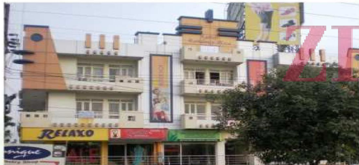
KUMAR RESIDENCY A new world of happiness PLAZA Plot No. 1, Sector 11, Vasundhra