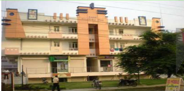
KUMAR EXCELLENCY A new world of happiness PLAZA Plot No. 8, Sector 11, Vasundhra