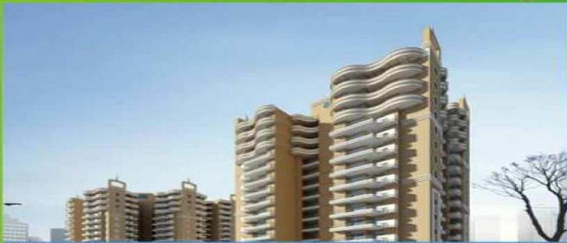
Roadside View of Kumar Golf Vista: The most happening destination