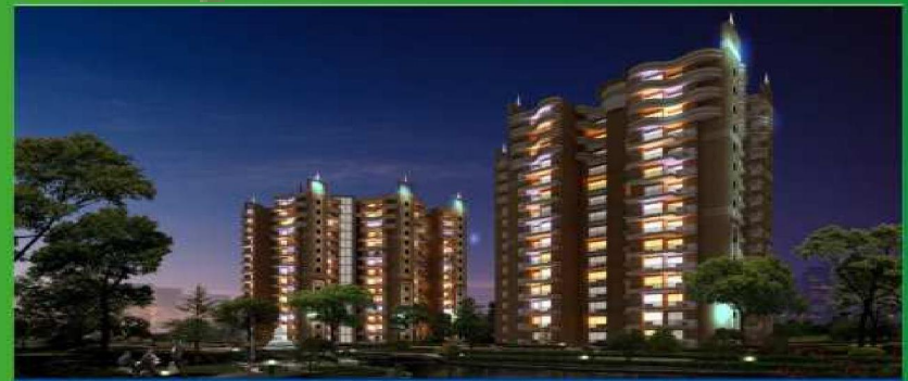
Splendid Night View of Kumar Golf Vista: Live with the bright star