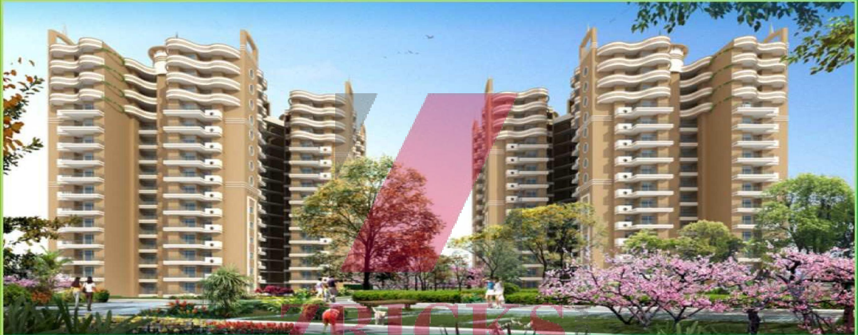
Picturesque Front View of Kumar Golf Vista: The best elevation in the locality