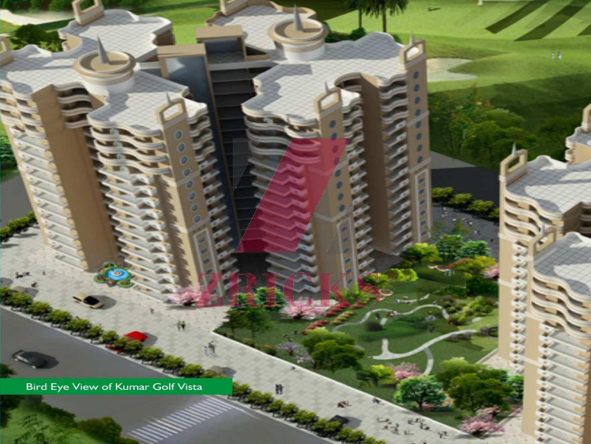
Bird Eye View of Kumar Golf Vista