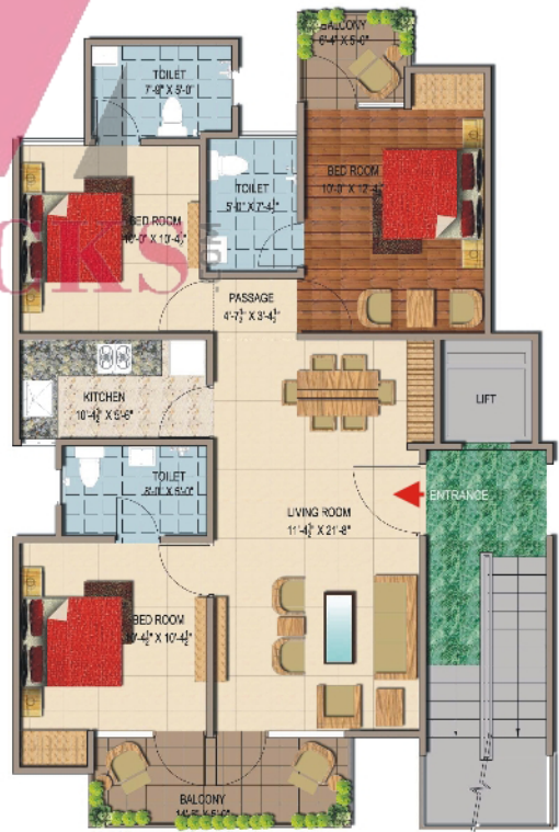
3 BHK Area 1215 sq.ft.