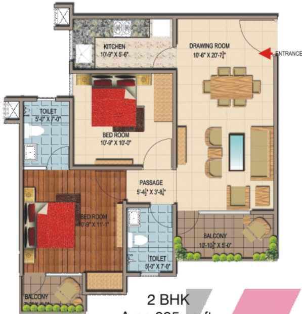
2 BHK Area 995 sq.ft.